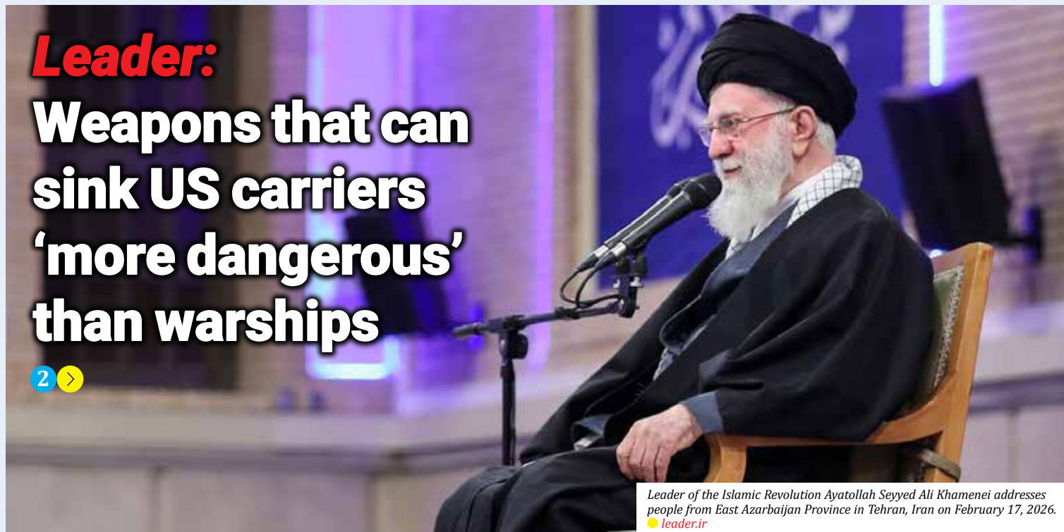
Leader of the Islamic Revolution Ayatollah Seyyed Ali Khamenei addresses people from East Azarbaijan Province in Tehran, Iran on February 17, 2026.