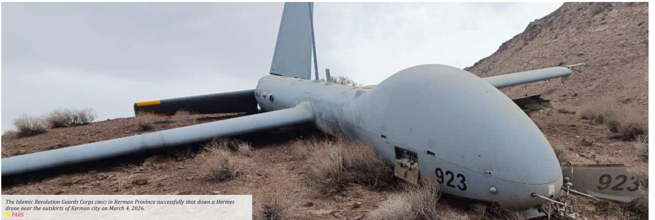
The Islamic Revolution Guards Corps (IRGC) in Kerman Province successfully shot down a Hermes drone near the outskirts of Kerman city on March 4, 2026.