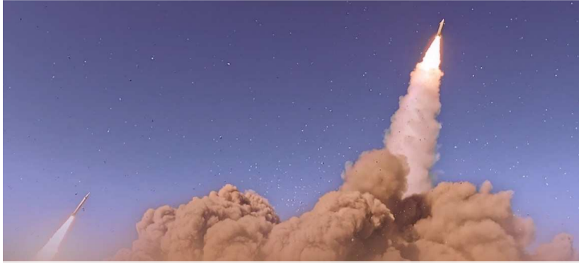
The screenshot shows missiles being fired from an unknown location in Iran toward Israel on March 4, 2026.

The Iranian Army reported on Wednesday that its air defense systems successfully destroyed six advanced enemy drones over the last 24 hours as they were flying over the Iranian territory.