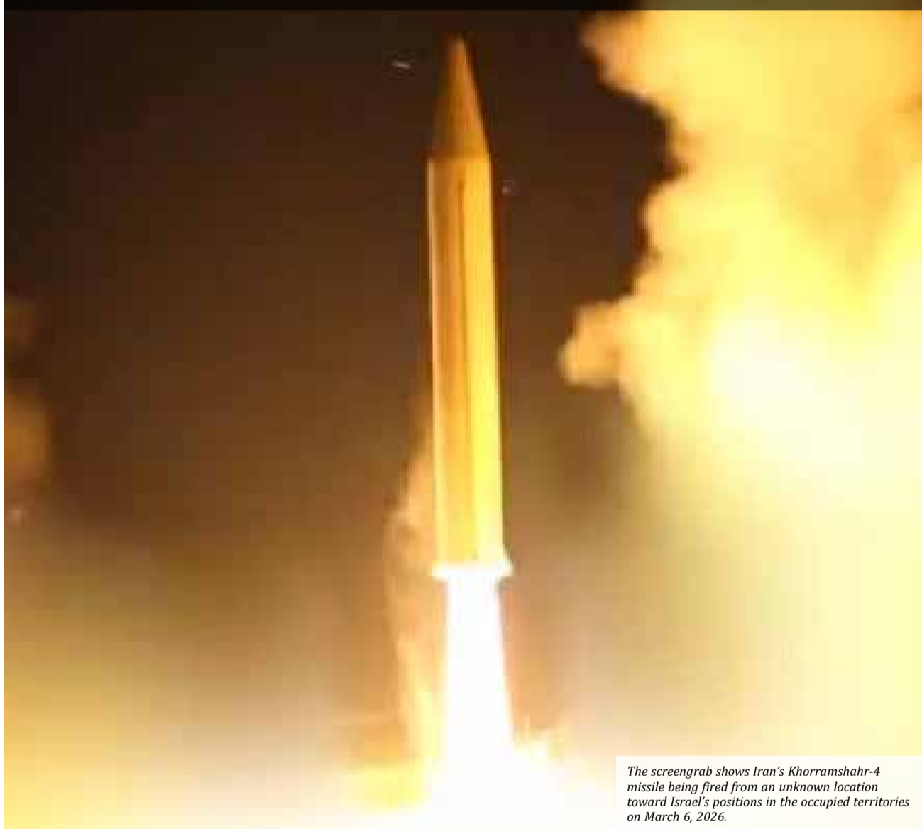
The screengrab shows Iran's Khorramshahr-4 missile being fired from an unknown location toward Israel's positions in the occupied territories on March 6, 2026.