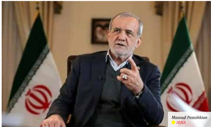
Masoud Pezeshkian