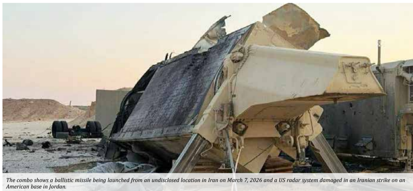
The combo shows a ballistic missile being launched from an undisclosed location in Iran on March 7, 2026 and a US radar system damaged in an Iranian strike on an American base in Jordan.