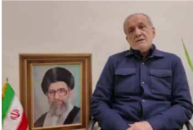
A screenshot shows President Masoud Pezeshkian speaking to the Iranian nation in a video message on March 7, 2026.

ruary 28, in response to which Iran has targeted US bases in neighboring countries. However, reports of strikes on civilian targets have emerged, prompting reactions from some of those nations. Earlier, Pezeshkian had said in a video message that the Leadership Council has explicitly instructed the armed forces not to launch missile strikes against neighboring countries unless an attack is originated from their territories against Iran. Tehran had previously warned of potential "false flag" operations by Israel to damage Iran's relations with its neighbors. Pezeshkian, who became a member of the Leadership Council following the martyrdom of Ayatollah Seyyed Ali Khamenei in an Israeli-American strike emphasized that Iran has no intention of initiating military aggression. "Our neighboring countries are our brothers... I believe that the issue with neighbors should be resolved through diplomacy," Pezeshkian said.