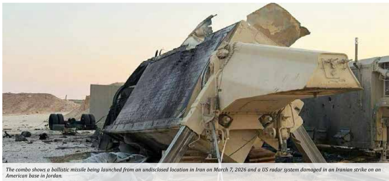
The combo shows a ballistic missile being launched from an undisclosed location in Iran on March 7, 2026 and a US radar system damaged in an Iranian strike on an American base in Jordan.