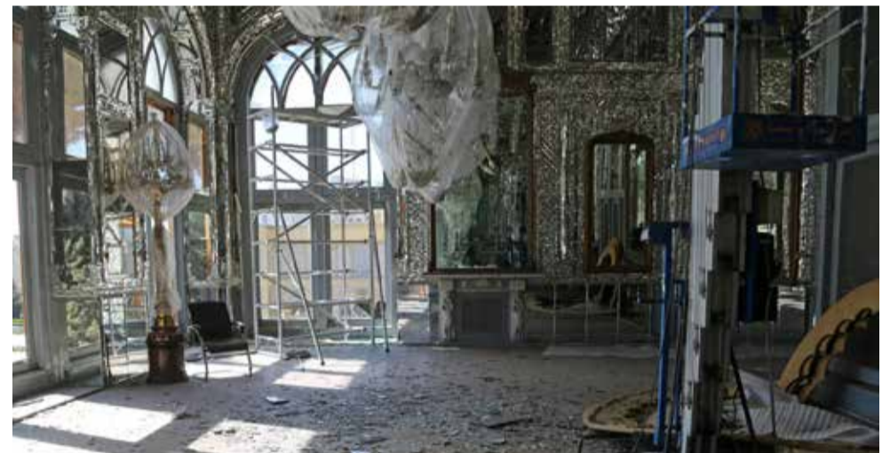
Golestan Palace on March 3, 2026, after it was damaged during US and Israeli airstrikes in Tehran, Iran

Iran's heritage deputy minister formally requested on March 7 that UNESCO grant "enhanced protection" status to all Iran's World Heritage sites, citing escalating regional hostilities and damage to Tehran's Golestan Palace following coordinated US-Israeli military operations which began on February 28. Ali Darabi, deputy minister for cultural heritage, wrote to UNESCO Director-General Khaled El-Enany invoking Articles 9 and 10 of the 1999 Second Protocol to The Hague Convention, which safeguards cultural property during armed conflict. The letter, dispatched from Tehran, included precise geographic coordinates for technical review, IRNA reported. Qajar-era Golestan Palace, a UNESCO World Heritage Site in 2013 in the heart of Tehran, sustained "significant damage" from recent explosions, Darabi said during a site visit. Blast waves shattered traditional Orsi windows (traditional wooden sash windows with colored glass), geometric wood latticework and