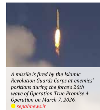
A missile is fired by the Islamic Revolution Guards Corps at enemies' positions during the force's 26th wave of Operation True Promise 4 Operation on March 7, 2026.

Since then, Iranian Armed Forces have decisively retaliated against the strikes by launching barrages of missiles and drones against the Israeli-occupied territories as well as US bases in region.