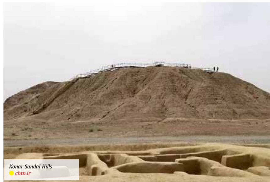
Konar Sandal Hills