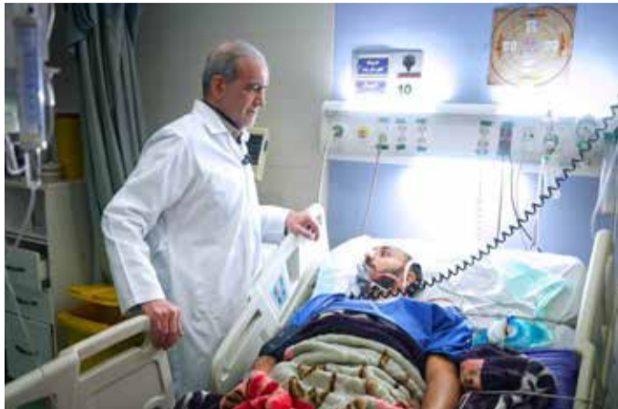
Iranian President Masoud Pezeshkian visits injured people in a hospital in Tehran on March 8, 2026 as US-Israeli strikes target civilian and military facilities across the country.

Secretary of Iran's Supreme National Security Council of Iran,