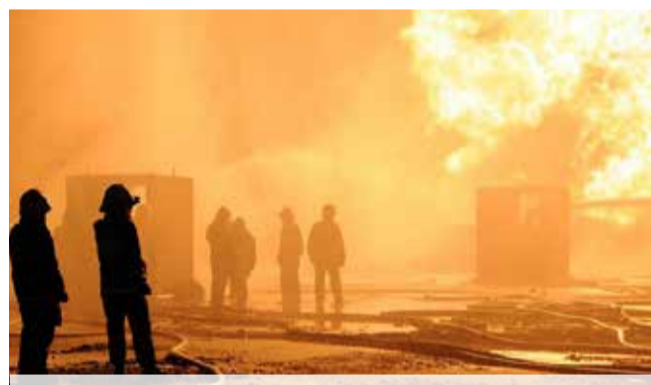
Firefighters battle flames at a fuel storage facility after enemy warplanes struck five fuel depots in Tehran and Alborz provinces on March 7, 2026.