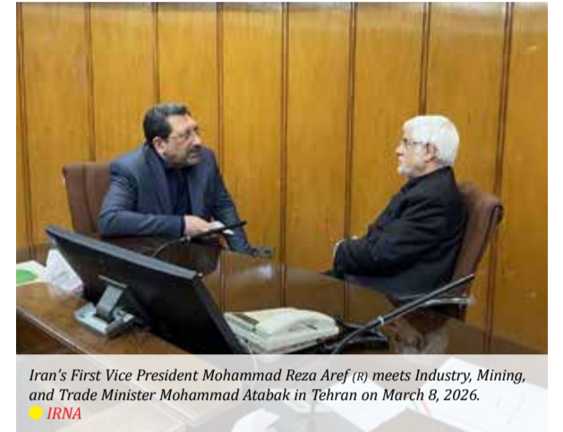
Iran's First Vice President Mohammad Reza Aref (R) meets Industry, Mining, and Trade Minister Mohammad Atabak in Tehran on March 8, 2026.

During the visit to the ministry, Aref was briefed on a detailed report regarding supply chain logistics, mar-