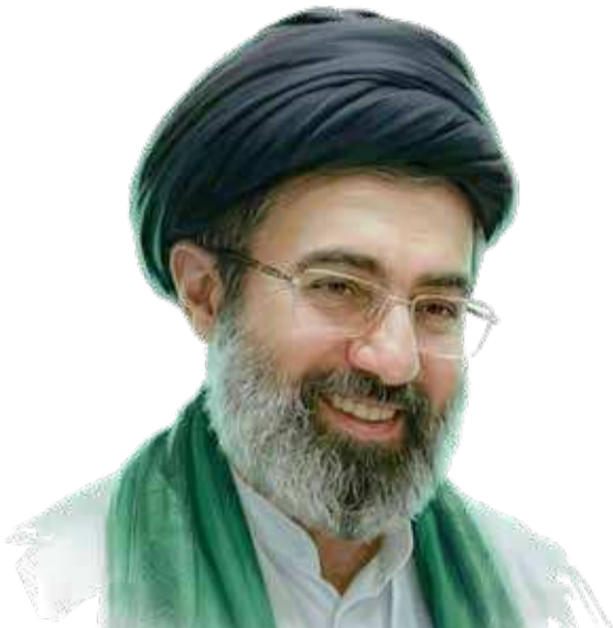
Iran's third Leader Ayatollah Seyyed Mojtaba Hosseini Khamenei releases his first message on March 12, 2026.

Regional countries should close US bases: Ayatollah Mojtaba Khamenei