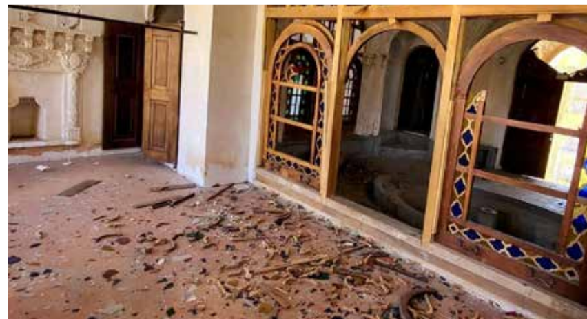
Debris is scattered inside the Asef Vaziri Mansion, known as the Kurdish House, after US-Israel attacks on Sanandaj, western Iran, in this undated handout image released in March 2026.