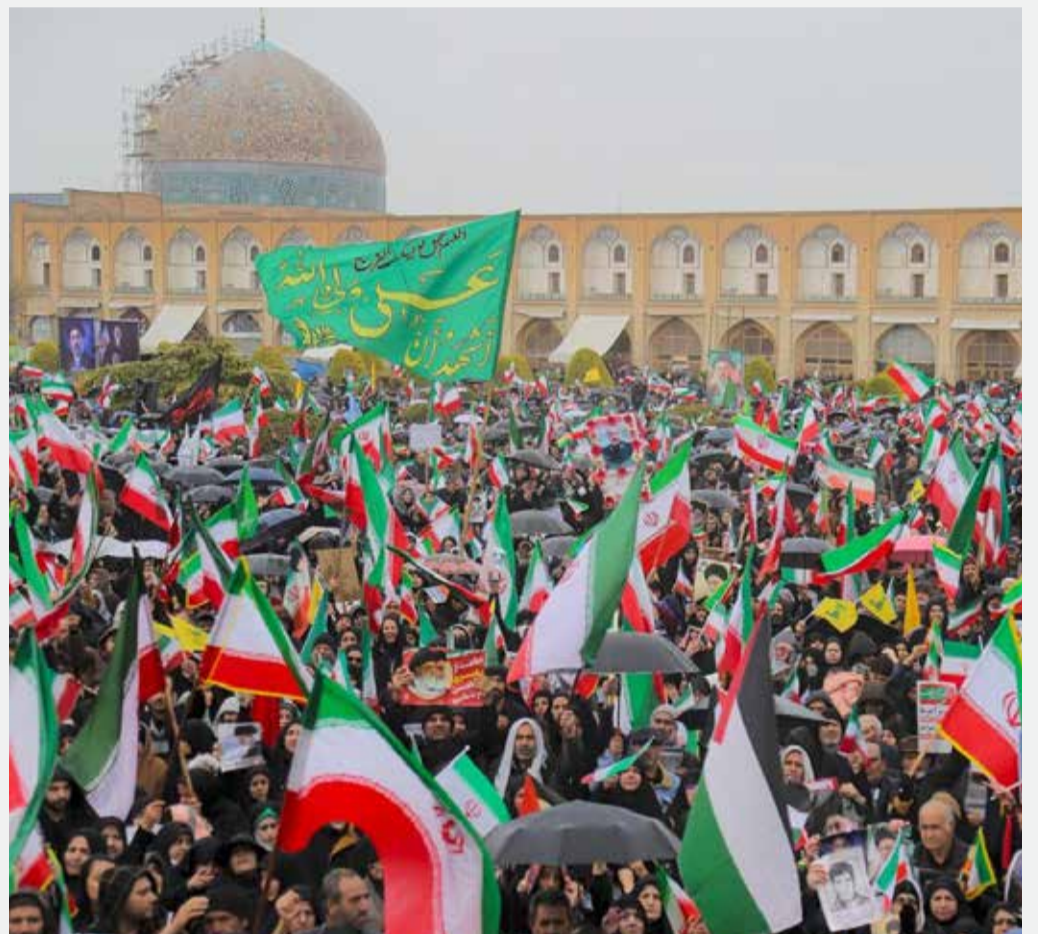
The combo shows Iranians in Tehran (L) and Isfahan rally to mark International Quds Day on March 13, 2026 amid an ongoing US-Israeli war on Iran.