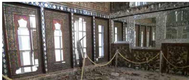
Broken glass and decorative fragments cover the floor of a mirror hall inside the Golestan Palace in Tehran after nearby explosions damaged the historic complex in Tehran, following recent American-Israeli strikes on Iran, in March 2026.

"The protection of cultural heritage is not only a national duty but a global responsibility to safeguard civilization and humanity," he wrote. "If the heritage of human civilization becomes a casualty of power conflicts, what will ultimately be lost is part of the world's moral memory."