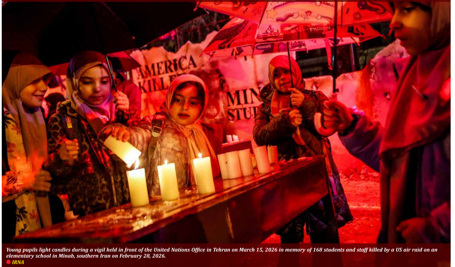
Young pupils light candles during a vigil held in front of the United Nations Office in Tehran on March 15, 2026 in memory of 168 students and staff killed by a US air raid on an elementary school in Minab, southern Iran on February 28, 2026.