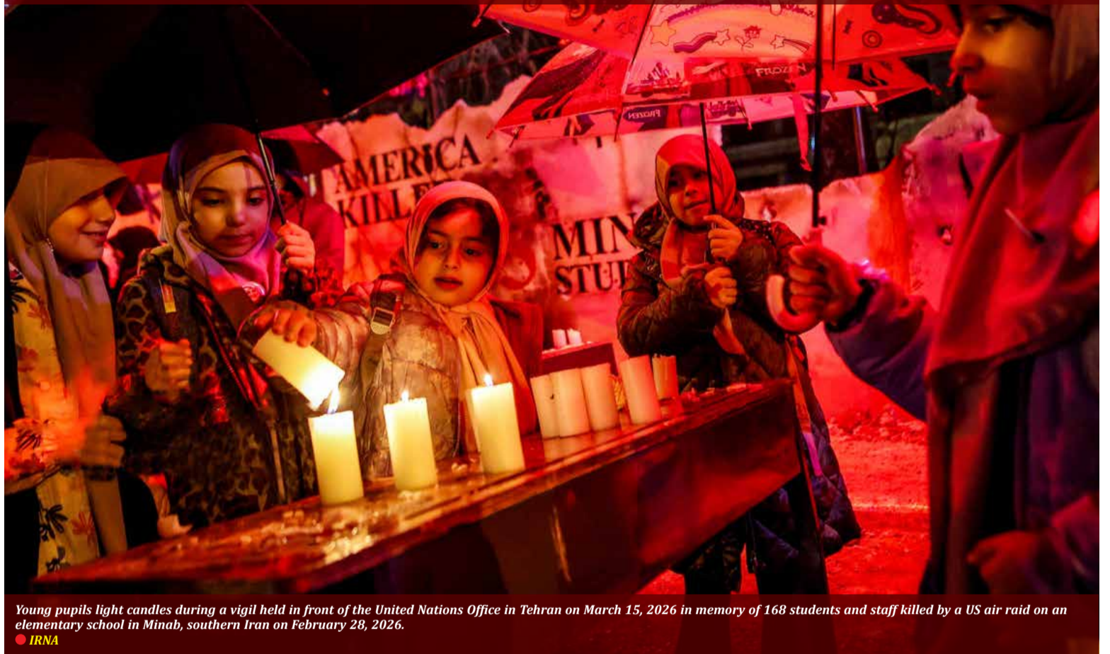
Young pupils light candles during a vigil held in front of the United Nations Office in Tehran on March 15, 2026 in memory of 168 students and staff killed by a US air raid on an elementary school in Minab, southern Iran on February 28, 2026.