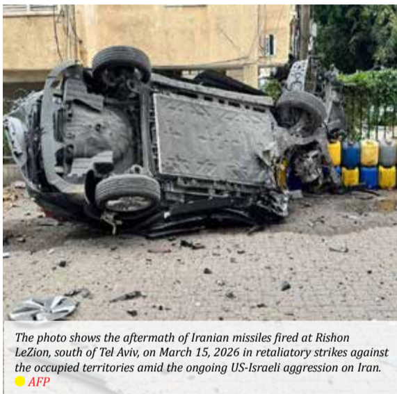
The photo shows the aftermath of Iranian missiles fired at Rishon LeZion, south of Tel Aviv, on March 15, 2026 in retaliatory strikes against the occupied territories amid the ongoing US-Israeli aggression on Iran.

The IRGC also said in another statement that its naval forces simultaneous-