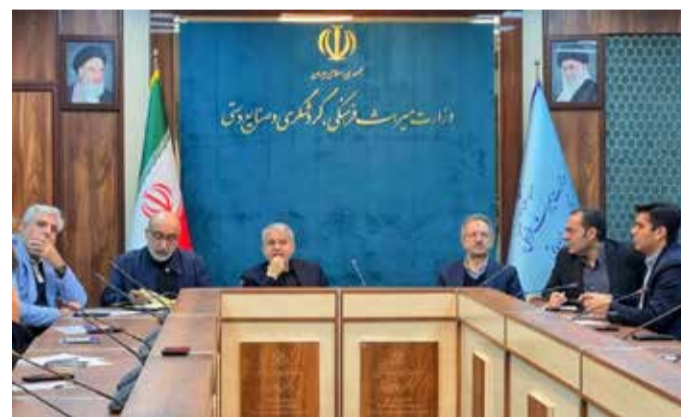
Iran's Minister of Cultural Heritage, Tourism and Handicrafts Reza Salehi-Amiri (3rd l) speaks during a meeting in Tehran on March 15, 2026.

hi-Amiri explained. He stressed that tourism, when properly managed, can serve as a tool for "shaping the social landscape" and "fostering hope and calm." Provinces are therefore called upon to design and roll out Nowruz events that reflect local heritage while honoring the "First Martyrs' Nowruz" of the nation's revered heroes. The minister urged officials to "bring forward" programs that blend artistic performances with commemorative ceremonies in city squares and public parks, thereby "draining" negative emotions and "strengthening" social empathy. Salehi-Amiri also stressed the centrality of the concept of