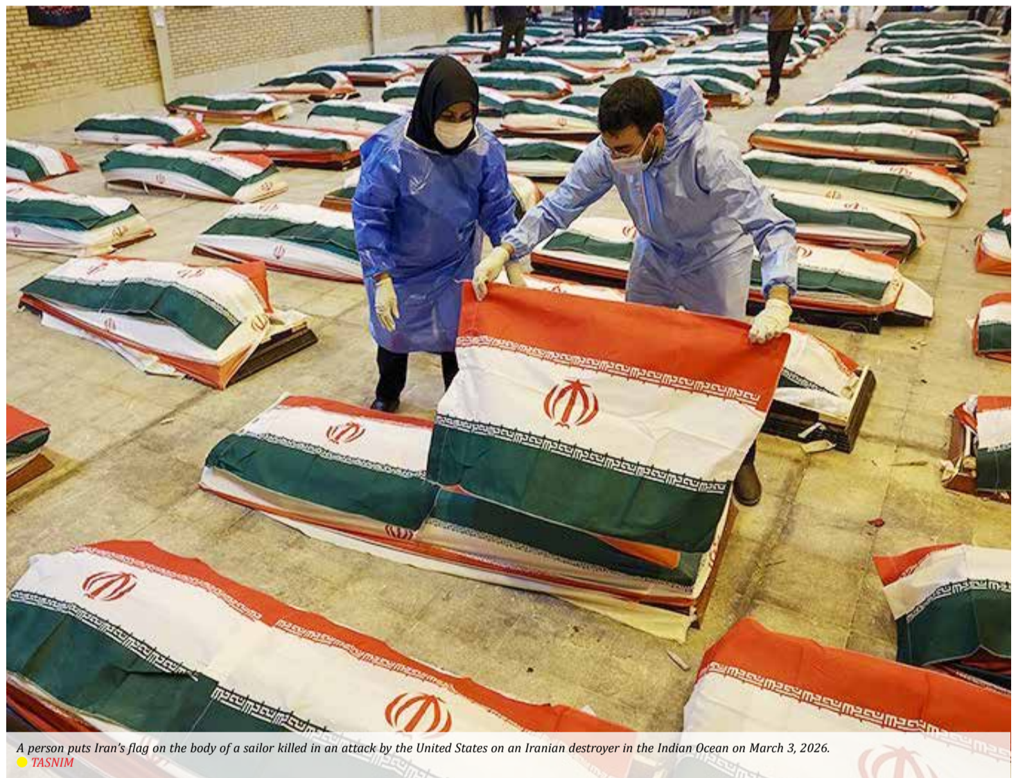
A person puts Iran's flag on the body of a sailor killed in an attack by the United States on an Iranian destroyer in the Indian Ocean on March 3, 2026.