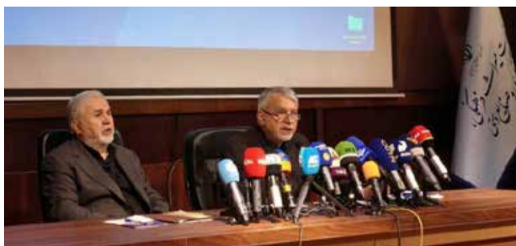
Iran's Minister of Cultural Heritage, Tourism and Handicrafts, Reza Saleh-Amiri (r) speaks during a press conference in Tehran on March 16, 2026.

"The conscience of the world and the Islamic world should know that the Islamic Republic of Iran has not initiated war, but the Iranian people have decided to defend every inch of this land, their historical identity, and their civilization with all their might," Saleh-Amiri stated.