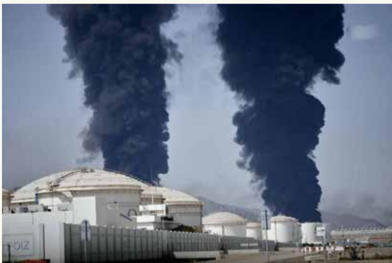
Thick plumes of smoke curl up from storage tanks in Fujairah, UAE after a recent attack.

The most immediate and severe consequences would be felt in the flow of crude oil and liquefied natural gas. According to EIA estimates, some 20.9 million barrels of oil and petroleum products pass through the Strait of Hormuz each day, accounting for about 20% of global liquid fuels consumption and almost a quarter of the world's seaborne oil trade. Put more precisely, it represents an extraordinarily large share of the oil actually moving through global commercial markets between producers and consumers. More than 89% of that flow heads to Asia — especially China, India and Japan — while a substantial portion of the world's LNG trade, much of it from Qatar, also passes through the same narrow corridor.