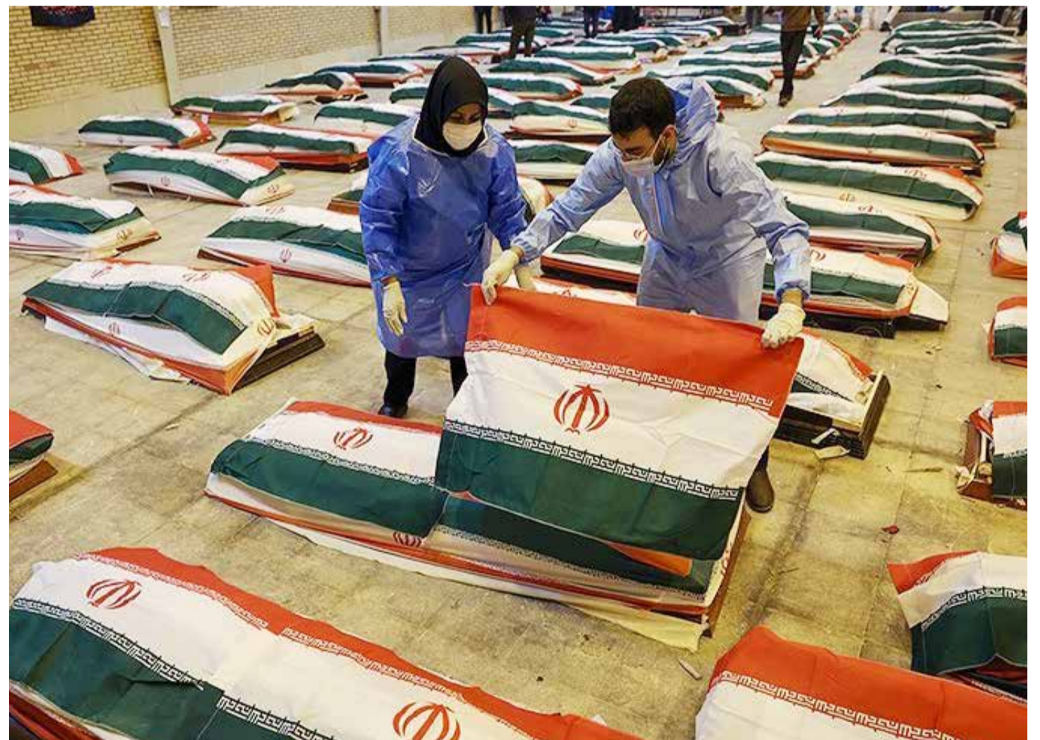
A person puts Iran's flag on the body of a sailor killed in an attack by the United States on an Iranian destroyer in the Indian Ocean on March 3, 2026.