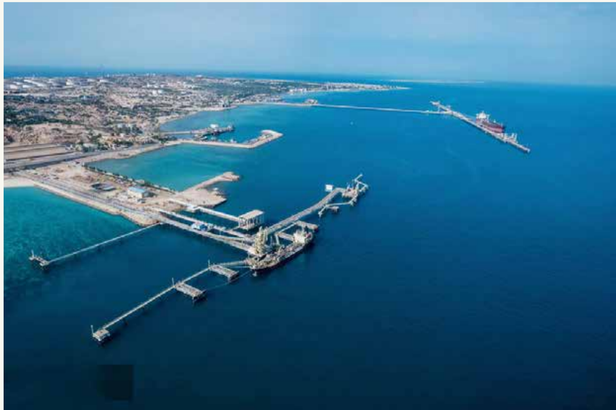
The photo shows an aerial view of Kharg Island, which houses Iran's main oil export terminal, and its jetties in the Persian Gulf.

Even a short disruption would send prices sharply higher. Brent crude, which traded near $71 before the war, could easily climb above $110 a barrel, with more pessimistic scenarios pushing it toward $150 or even $200. That risk is magnified by the structure of the global refining system. Many refineries were configured specifically for the heavier, sourer grades of Persian Gulf crude, with particular API specifications. Replacing those barrels with lighter alternatives — including US shale — is not simply a matter of swapping one stream for another. It often requires blending, operational adjustments or months of process changes. Strategic