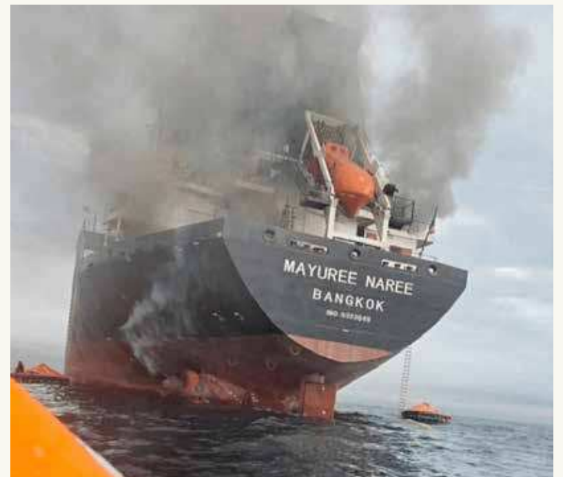
Smoke rises from a vessel in the wake of an attack during the ongoing military tensions in the Persian Gulf.

Kharg Island remains the central node in this story. A significant share of Iran's oil exports passes through the island, making it a prime target in any campaign aimed at constricting Tehran's revenue. Even where storage or