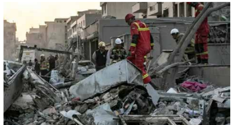
Rescue workers sift through the wreckage of a Tehran residential block after a US-Israeli strike hit the neighborhood.

The Iranian cultural community hopes to break through the perceived silence and bring attention to the human cost of the conflict.