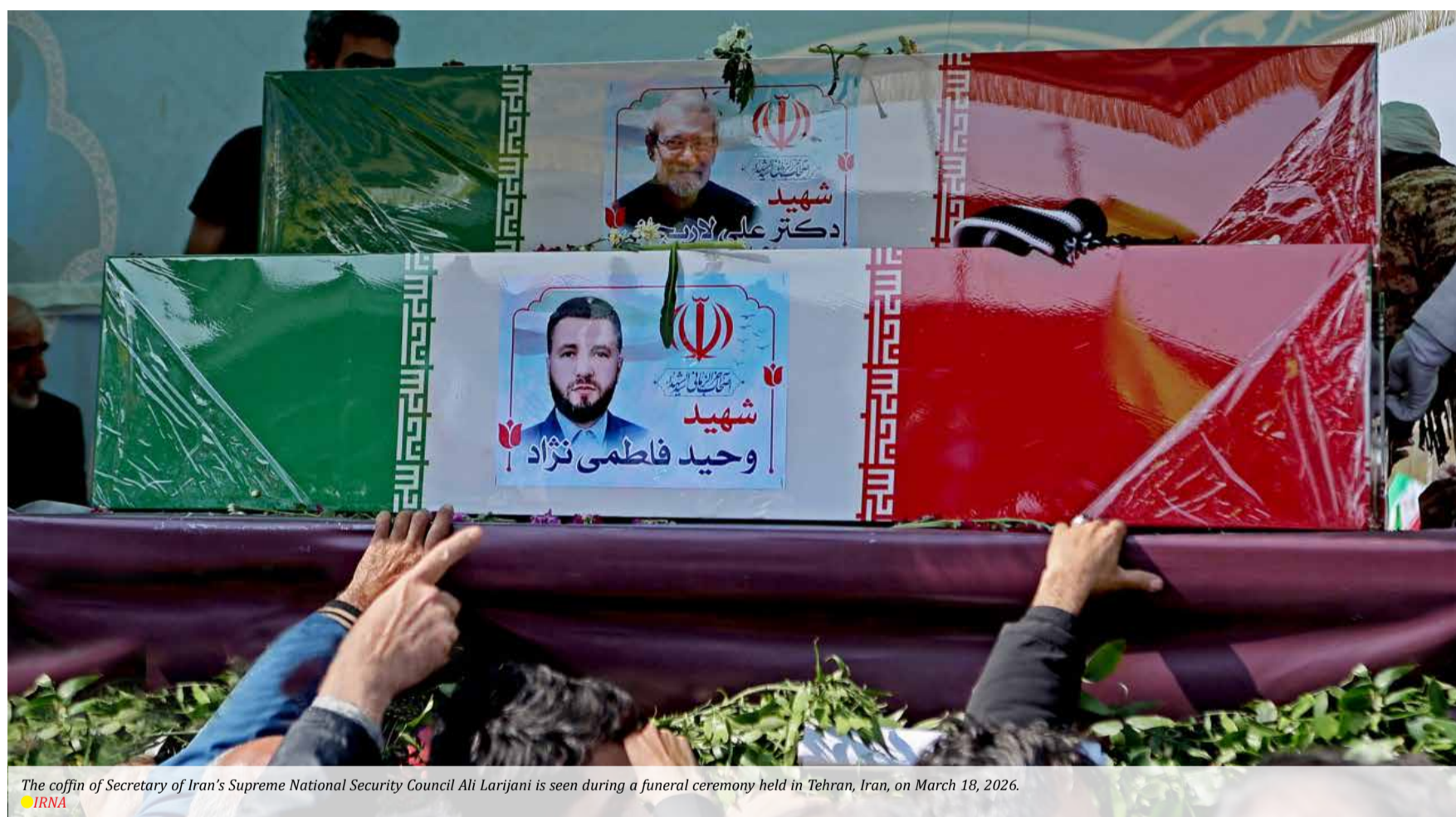
The coffin of Secretary of Iran's Supreme National Security Council Ali Larijani is seen during a funeral ceremony held in Tehran, Iran, on March 18, 2026.