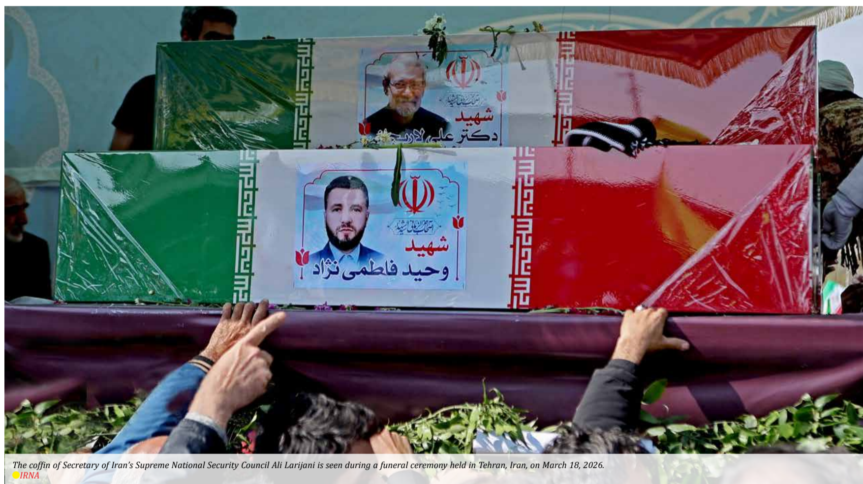
The coffin of Secretary of Iran's Supreme National Security Council Ali Larijani is seen during a funeral ceremony held in Tehran, Iran, on March 18, 2026.