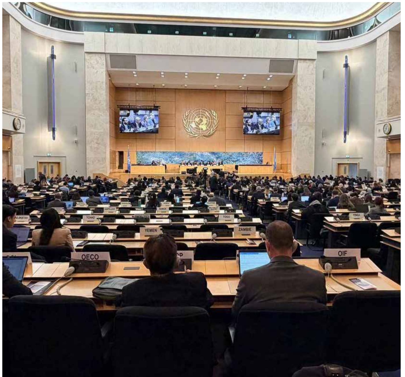
The UN Human Rights Council holds an emergency session in Geneva, in Switzerland, to address the attack on a primary school in Minab on March 27, 2026.