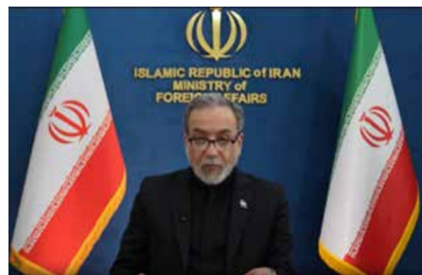
Iranian Foreign Minister, Abbas Araghchi, addresses the UN Human Rights Council session on Minab school attack through video conference on March 27, 2026.

The session, requested by Iran, China, and Cuba, aimed to address and condemn the airstrikes by the United States and Israel. Senior Iranian and international officials, including Iran's Foreign Minister, the UN High Commissioner for Human Rights, and a special rapporteur on the right to education, delivered speeches.