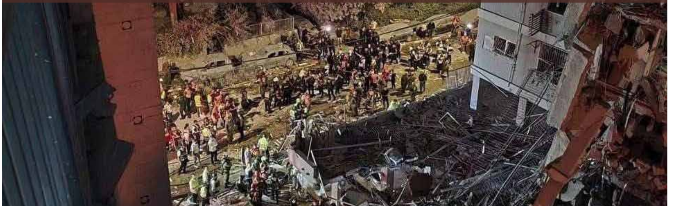
People gather around the site of an Iranian retaliatory missile that struck Arad, located 45 kilometers from Beersheba in the south of the occupied territories.