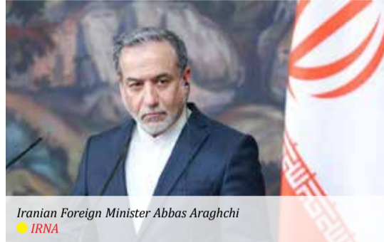
Iranian Foreign Minister Abbas Araghchi

Pezeshkian's message to the countries of the region is that "if you are seeking development and security, do not allow our enemies to conduct war from your countries."