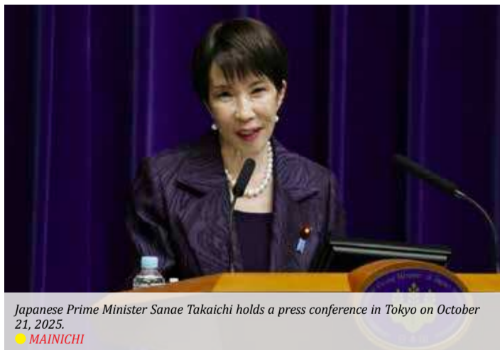
Japanese Prime Minister Sanae Takaichi holds a press conference in Tokyo on October 21, 2025. ● MAINICHI

The US-Israeli strikes began on February 28 amid ongoing indirect diplomacy. Iran responded with calibrated missile and drone operations against military targets linked to the aggressors, framing the action as self-defense under Article 51 of the UN Charter and warning of a stronger response to any escalation.