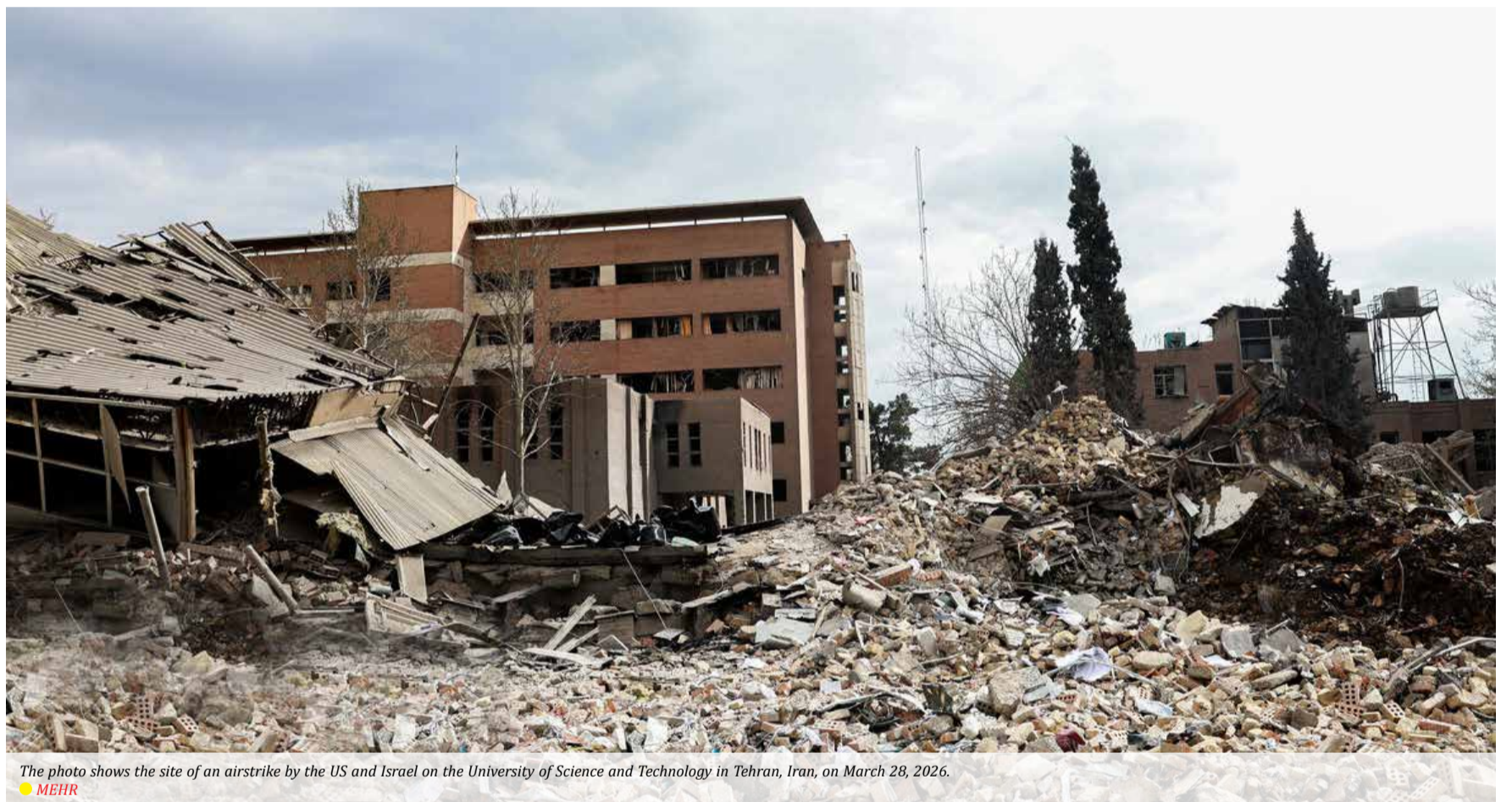
The photo shows the site of an airstrike by the US and Israel on the University of Science and Technology in Tehran, Iran, on March 28, 2026.

"Leaders of the reckless White House must understand: from