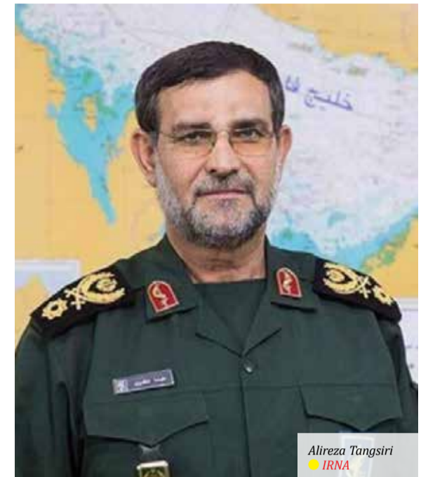
Alireza Tangsiri