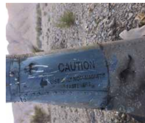
The remains of an American F-35 fighter jet shot down by the IRGC in the sky over central Iran on April 3, 2026.