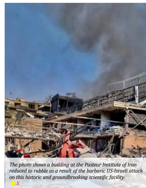
The photo shows a building at the Pasteur Institute of Iran reduced to rubble as a result of the barbaric US-Israeli attack on this historic and groundbreaking scientific facility. ● X

"Heartbreaking, cruel, despicable, and utterly outrageous... This is not merely another war crime committed as part of an illegal war; it is a barbaric assault on basic human core values," the spokesman added.