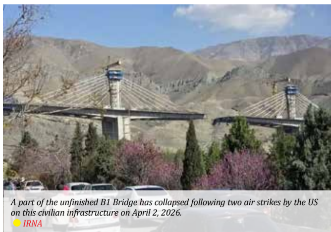
A part of the unfinished B1 Bridge has collapsed following two air strikes by the US on this civilian infrastructure on April 2, 2026.

Iranian Foreign Minister Abbas Araghchi said the US strikes on civilian infrastructure, including the unfinished bridge in Karaj, demonstrate Wash-