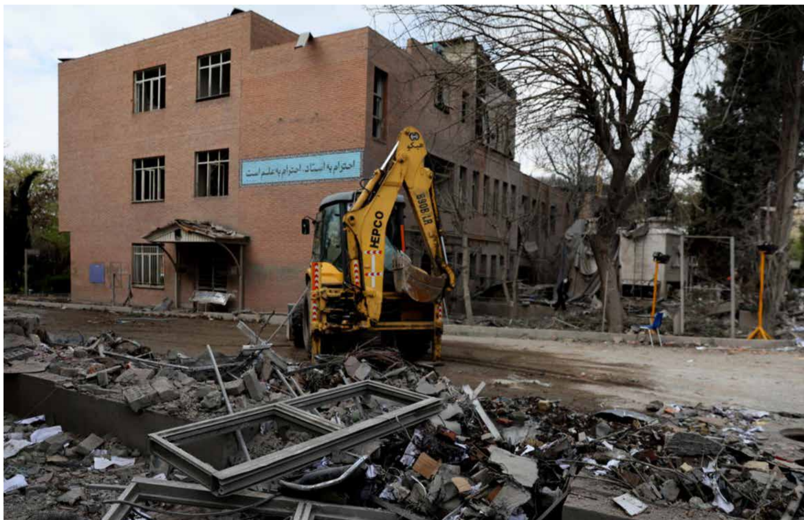
The photo shows the aftermath of a US-Israeli strike on Iran University of Science and Technology (IUST) in Tehran on March 28, 2026.