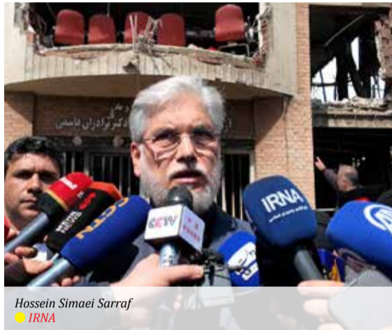
Hossein Simaei Sarraf

He told reporters on Saturday that over 30 universities across the country have been directly targeted in the US and Israeli attacks on Iran. Simaei Sarraf made the remarks on Saturday following an attack by Israel on the laser and plasma research center at Tehran's Shahid Beheshti University. He added that Tehran's University of Science and Technology and Isfahan University of Technology, among others, were also subjected to "brutal attacks" in recent weeks. "According to international documents, attacks on these scientific infrastructures are not only a violation of international law but also constitute a crime against humanity," the minister said. He emphasized that millions of students and researchers have been deprived of