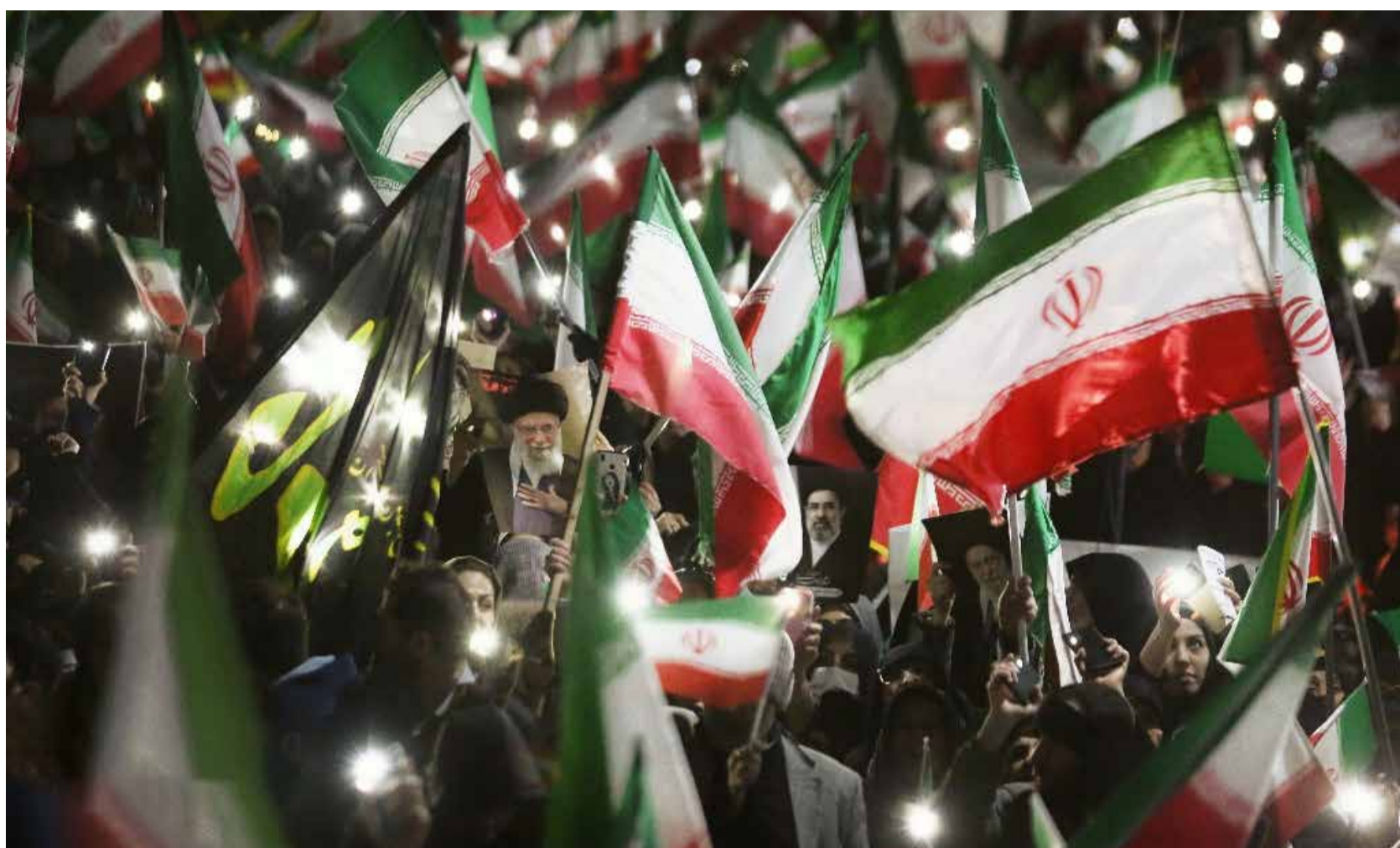
People wave Iran's flags during a gathering to support the establishment amid an aggression by the US and Israel in the city of Shahr-e Kord, Iran, on April 4, 2026.