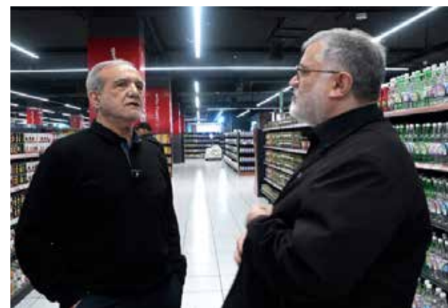
Iranian President Masoud Pezeshkian (L) inspects the stocked shelves of a chain store in Tehran, Iran, on March 27, 2026, during the US-Israeli war on the country.