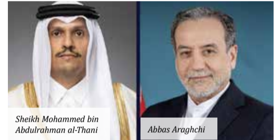
Sheikh Mohammed bin Abdulrahman al-Thani