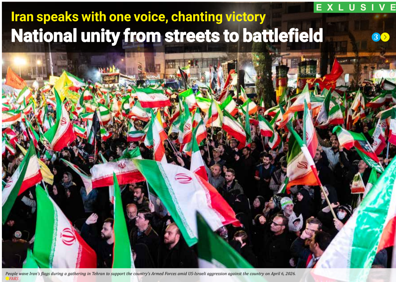
People wave Iran's flags during a gathering in Tehran to support the country's Armed Forces amid US-Israeli aggression against the country on April 6, 2026.