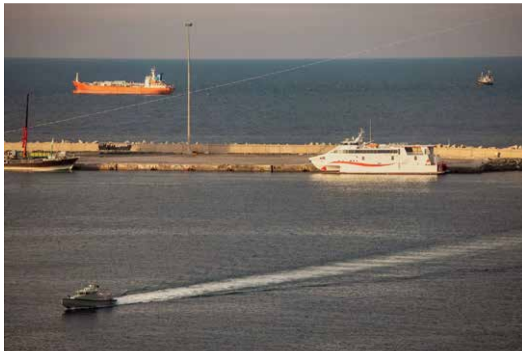
A police speedboat patrols the port as oil tankers and high-speed crafts sit anchored near the Strait of Hormuz in Muscat, Oman, on March 30, 2026.

First, the applicable treaty framework does not support the imposition of the "transit passage" regime on Iran. The United Nations Convention on the Law of the Sea (UNCLOS) introduced transit passage as a novel legal construct, granting expansive rights — including overflight and submerged navigation — to foreign military assets. However, Iran never ratified UNCLOS and explicitly rejected this regime upon signature. Under general principles of treaty law, a state cannot be bound by provisions of a treaty it has not ratified, particularly where it has expressly objected to those provisions at the time of signature.