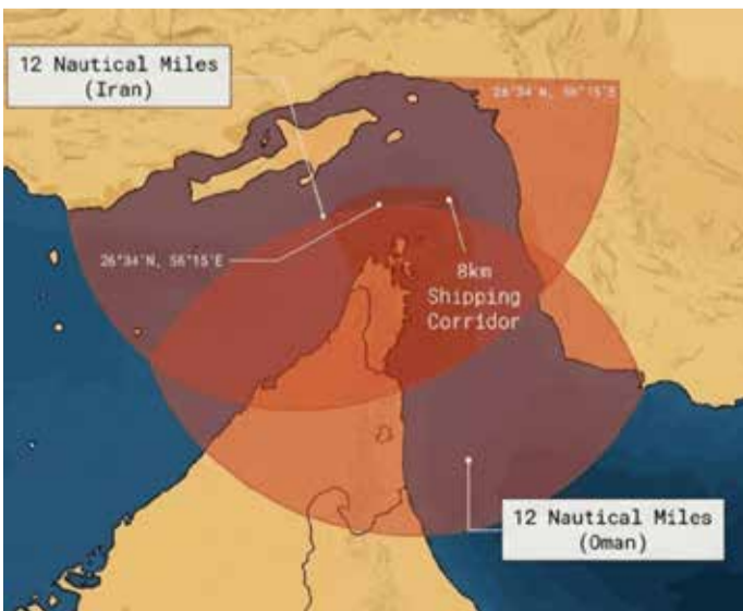
The map shows the overlapping territories of Iran (above) and Oman at the Strait of Hormuz. ● nextgenlearning.org.uk

Finally, the conduct of other states further undermines any claim that Iran's position is exceptional. The United States itself is not a party to UNCLOS, yet selectively invokes its provisions as customary law when convenient.