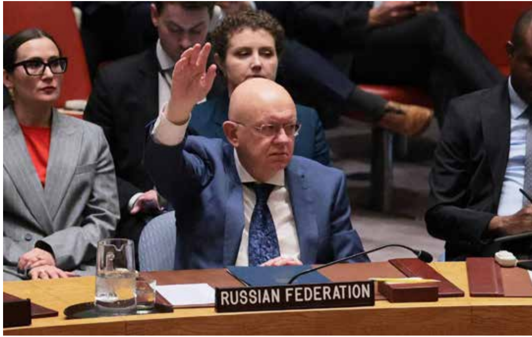
Russia's Permanent Representative to the UN Vasily Nebenzya (front) vetoes a resolution encouraging states to protect commercial shipping in the Strait of Hormuz, during a United Nations Security Council meeting at UN headquarters in New York City, US, on April 7, 2026.

budget and the domestic social contract; • In such an environment, any significant disruption to energy supply — from tensions in the Strait of Hormuz to reductions in Russian exports — feeds di-