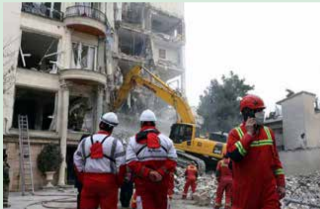
Iranian firefighters with the help of an excavator clear rubble from a destroyed residential building in northern Tehran.

Iran's Red Crescent Society on Friday attributed damage to more than 125,000 civilian structures across the Islamic Republic to US-Israeli military operations that began on February 28, 2026, as the nation's Human Rights Headquarters separately denounced the strikes as deliberate war crimes violating international humanitarian law. Pirhossein Kolivand, president of the Iranian Red Crescent Society (IRCS), detailed in a televised assessment that residential properties accounted for approximately 100,000 of the compromised units, with numerous dwellings entirely razed, while commercial establishments sustaining losses totaled 23,500. Medical infrastructure bore significant brunt: 339 facilities, including Vali-Asr, Shahid Motahhari and Khatam hospitals alongside pharmacies, laboratories and emergency centers, incurred damage, though several resumed operations within 24 hours. Educational institutions faced widespread disruption, with 32 universities and 857 schools damaged, alongside 20 Red Crescent facilities directly targeted during the 39-day period of intensified hostilities. Critical infrastructure also suffered, comprising 15 strategic sites, five fuel depots, airports and civilian aircraft, while 49 rescue vehicles and 43 ambulances were struck during humanitarian operations. Iran's Human Rights Headquarters, issuing a concur-