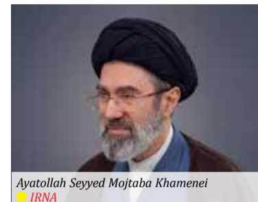
Ayatollah Seyyed Mojtaba Khamenei