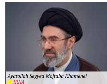
Ayatollah Seyyed Mojtaba Khamenei