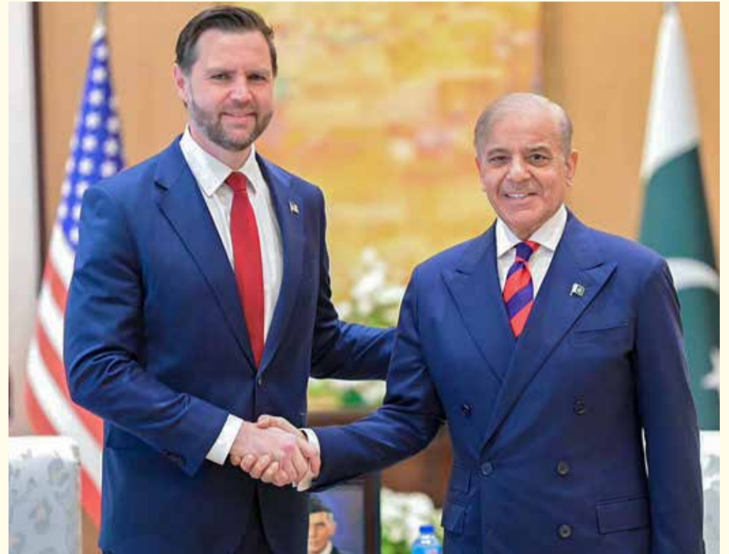
The combo shows Iran's Parliament Speaker Mohammad Baqer Qalibaf (left photo) shake hands with Pakistani Prime Minister Shehbaz Sharif who also meets with US Vice President JD Vance (right photo) in Islamabad, Pakistan ahead of Iranian-US talks on April 11, 2026.