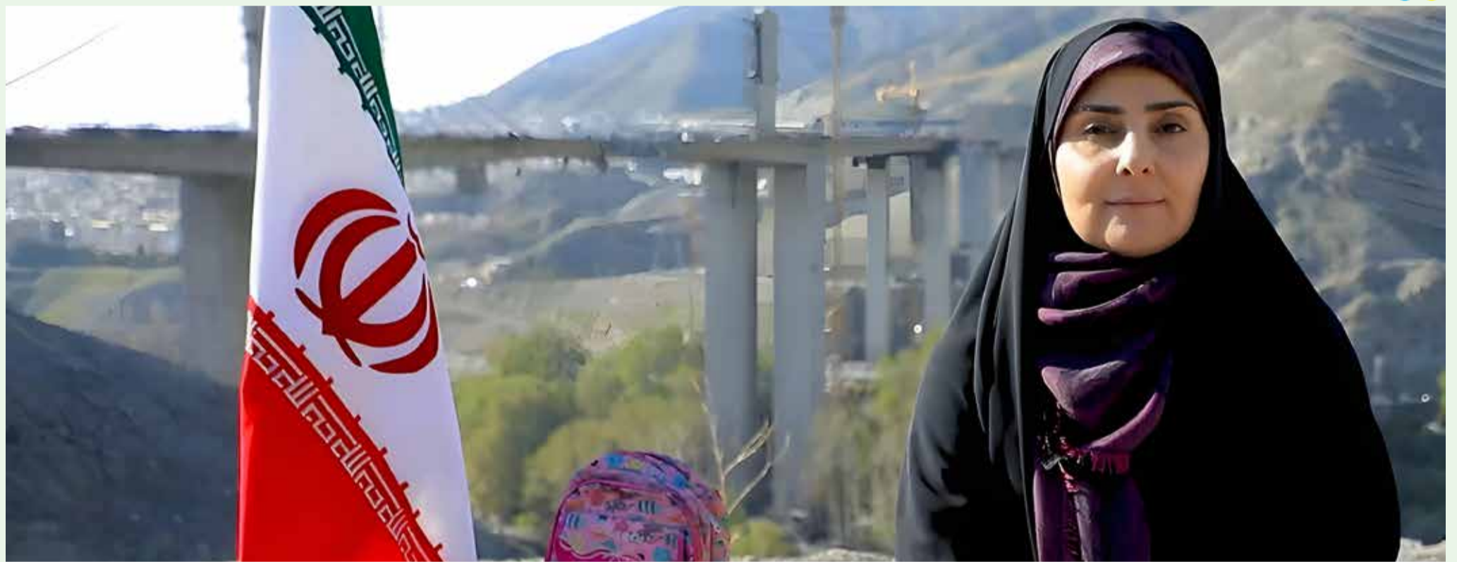
Iranian Minister of Roads and Urban Development, Farzaneh Sadegh Malvajerd, addresses the 13th Transport Ministers' Meeting of the Shanghai Cooperation Organization (SCO) via videoconference near the bombed-out B1 bridge, which was damaged in US strikes earlier this month, in Karaj, Iran on April 24, 2026.