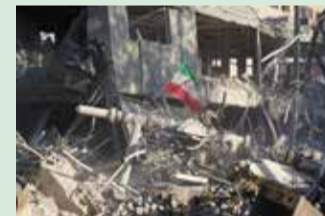
An Iranian flag is seen flying amidst the rubble and debris at Sharif University in Tehran following US-Israeli strikes on April 6, 2026.

A group of 239 prominent Turkish academics said in a joint statement reported Saturday by Iran's Student Affairs Organization that recent US and Israeli strikes on Iranian universities and research centers constitute "epistemicide," condemning the attacks as violations of international law and assaults on humanity's intellectual heritage. The signatories described universities as inviolable sanctuaries and said targeting educational infrastructure breaches conventions that protect civilian and scientific sites during conflict, ILNA reported. They warned that attacks on campuses and intimidation of Iranian scientists risk militarizing academia and eroding global scholarly security. The statement called on UNESCO and the United Nations to roll out an emergency protection mechanism for universi-