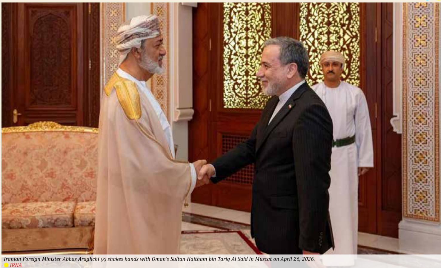
Iranian Foreign Minister Abbas Araghchi (R) shakes hands with Oman's Sultan Haitham bin Tariq Al Said in Muscat on April 26, 2026.