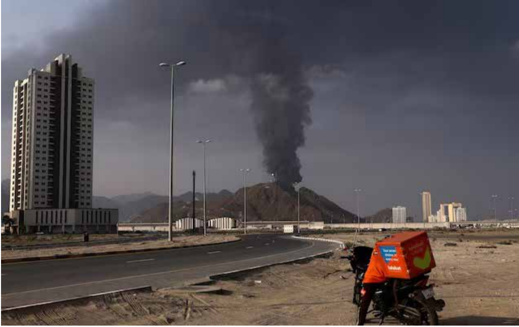
A person stands next to a motorcycle as smoke rises in the Fujairah oil industry zone, the UAE, on March 3, 2026, amid the US-Israel conflict with Iran.

among their own citizens. The United Arab Emirates has launched one of the more aggressive Persian Gulf state crackdowns. As of early April, security services in Abu Dhabi alone had reportedly made 375 arrests for filming damage from strikes or “publishing misleading information.” According to the attorney general, the arrests — which swept up people of various nationalities — fell into three expansive categories: publishing authentic but sensitive video clips, fabricating visual content, and “glorifying a hostile state and its political and military leadership.” The deeper subtext concerns Abu Dhabi’s acute sensitivity to any damage to the country’s carefully curated image as an enclave of stability and prosperity and to the nationalism it has worked hard to cultivate among citizens. Protecting both, in the regime’s calculus, requires a firm grip over the informational space, making the “media battle,” as one Emirati official put it at a recent GCC meeting, “no less important than the battle of arms.”