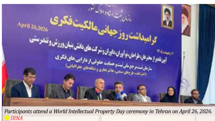
Participants attend a World Intellectual Property Day ceremony in Tehran on April 26, 2026.