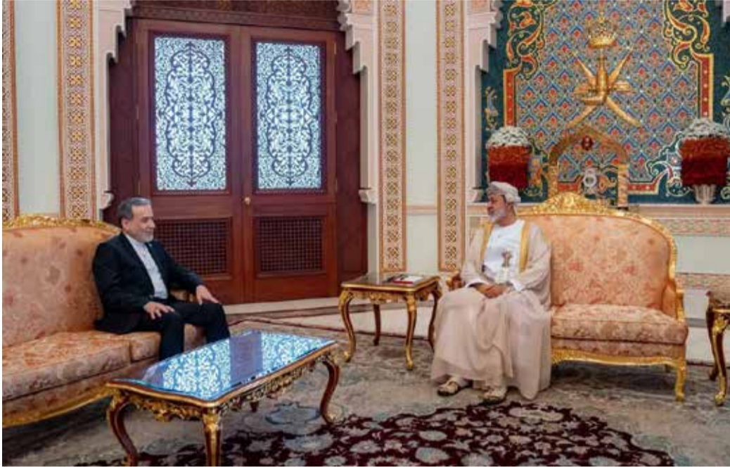
Iran's Foreign Minister Abbas Araghchi (L) meets Oman's Sultan Haitham bin Tariq Al Said in Muscat on April 26, 2026.

International Desk Iranian Foreign Minister Abbas Araghchi said the experience of the war against Iran showed that the US military presence in