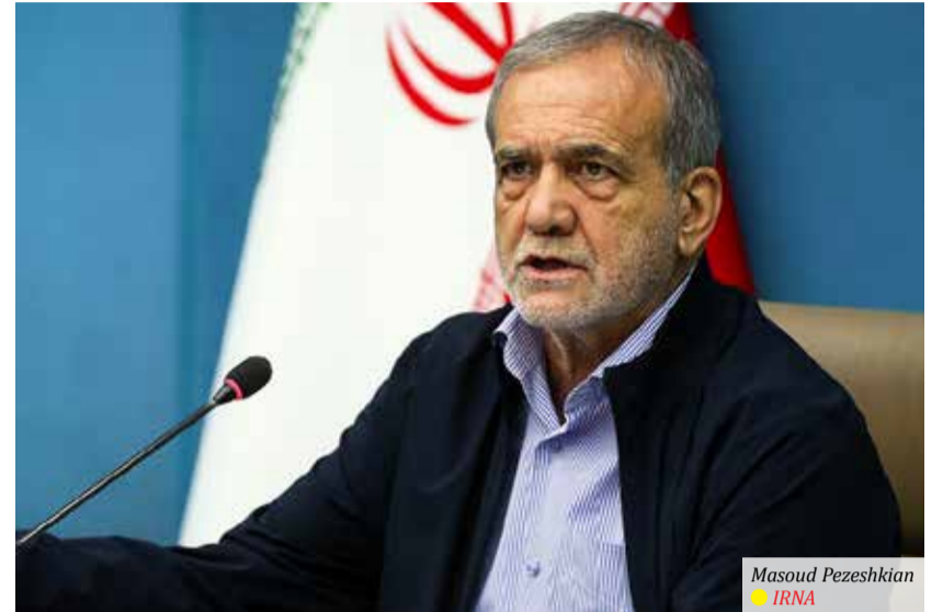
Masoud Pezeshkian

Pezeshkian commended the performance of economic and service institutions in maintaining relative stability and preventing disruptions to daily life, while calling for continued field management, rapid decision-making, cross-sector coordination and maximum use of national capacities to navigate current conditions.