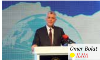
Omer Bolat

Iran remains in wartime conditions. Tehran and Washington agreed to a temporary ceasefire on April 8 with Pakistan's mediation after a 40-day war, launched by the US