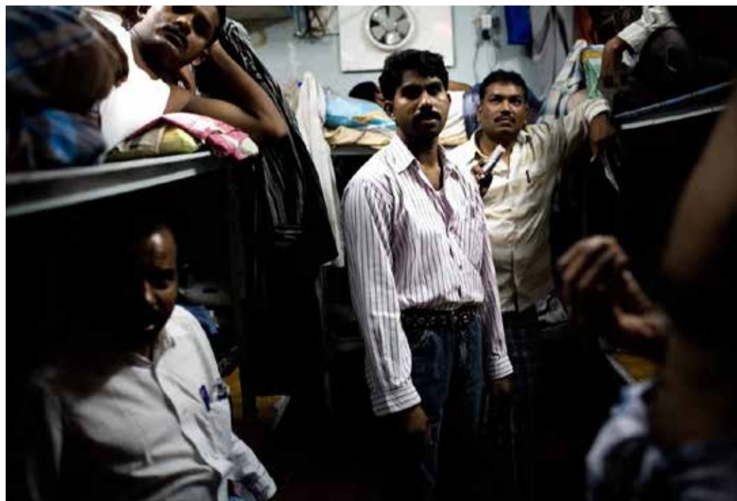
Migrant workers in their sleeping quarters in the United Arab Emirates

Even as this war has exposed flaws in governance and economic organization across the Persian Gulf, these trends do not pose a serious risk to national viability — even in states like Bahrain facing inordinate social strife. If anything, the stress tests reveal an opportunity. As regime impulses lurch toward tighter control — whether over perceived security threats or economic downturns — zealotry may prove self-defeating. Draconian measures to monitor and silence disaffected publics risk backlash down the line, and continued failures to protect migrant workers could undermine a vital engine of the region’s economies. Persian Gulf monarchies would do well, then, to accelerate rather than pause their ongoing reforms, fostering greater resilience, inclusivity, and unity.