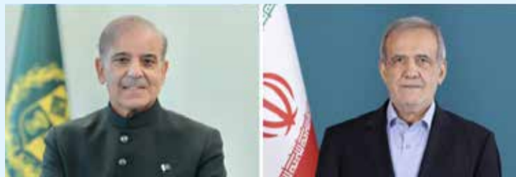
President Masoud Pezeshkian (R) holds a phone conversation with Pakistani Prime Minister Shehbaz Sharif on the latest status of the Iran-US war on April 26, 2026.

Pakistani PM urges adherence to diplomacy, political solution