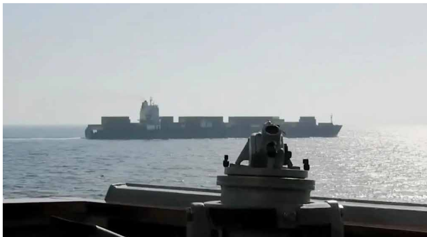
The screenshot of a video posted by US Central Command (CENTCOM) shows a US Navy destroyer warning and then firing on an Iranian-flagged cargo ship in the Arabian Sea on April 19, 2026.