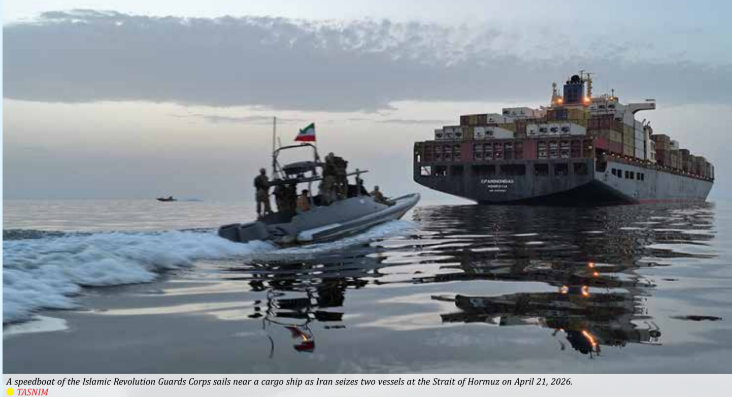
A speedboat of the Islamic Revolution Guards Corps sails near a cargo ship as Iran seizes two vessels at the Strait of Hormuz on April 21, 2026.