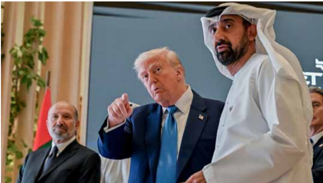
US President Donald Trump (2nd-L) attends the US-UAE Business Council in Abu Dhabi, United Arab Emirates, on May 16, 2025.

The UAE's withdrawal is not a transient event but a breaking point in the architecture of the oil market. Based on the analyses, the implications are as follows: • Diminished OPEC cohesion, making supply management more challenging. • Increased bargaining power for independent producers. • Heightened pressure on OPEC to adapt to climate standards. • A necessity to redesign OPEC's structure, focusing on flexibility, technology, and decarbonization. In this evolving landscape, the future of OPEC and OPEC+ will depend not only on production agreements but also on members' adaptability to a low-carbon economy, clean technologies, and the structural competition within the Persian Gulf. Nations that swiftly transition towards cleaner energy sources and resilient economic structures will emerge as the frontrunners in this era of transformation.