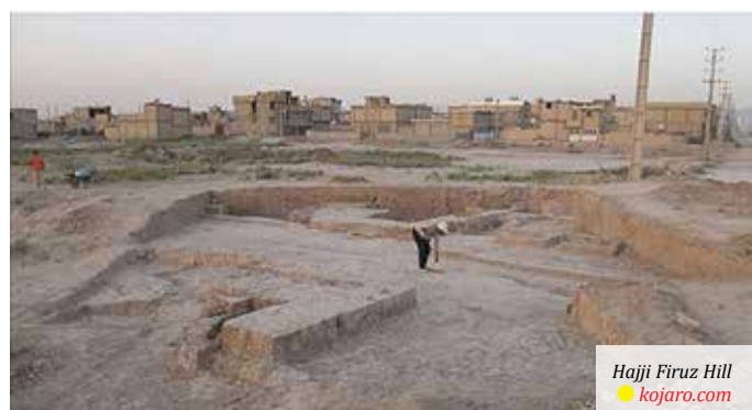
Hajji Firuz Hill kojara.com

other significant archaeological site located 25km east of Urmia, near village with the same name, about 1km from the road to Urmia Lake.