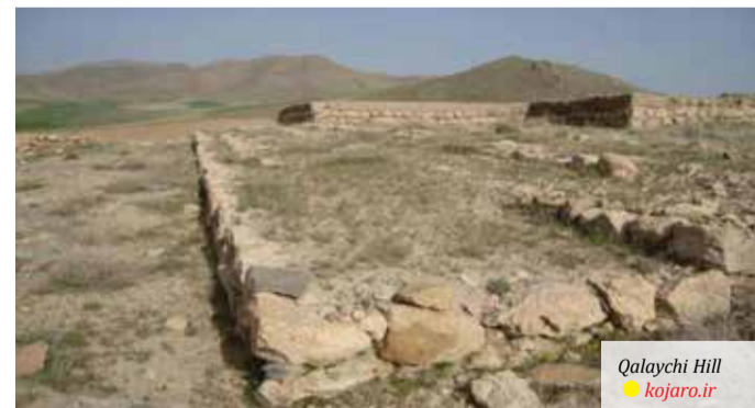
Qalaychi Hill kojara.ir