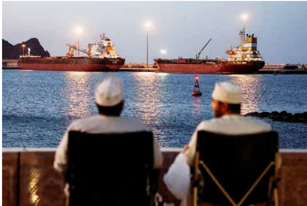
The Galaxy Globe bulk carrier and the Luojiashan tanker sit anchored in Muscat, Oman, on March 9, 2026, as Iran vowed to close the Strait of Hormuz.

This shift, coupled with the possibility of collecting tolls for the Strait of Hormuz, demonstrates that Iran presently holds a central position in the regional game and plays an explicitly