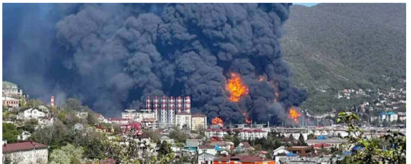
A huge plume of smoke rises as a result of Ukrainian drone attacks on the oil refinery in Tuapse, Russia, on April 28, 2026. ● SOCIAL MEDIA

The report from HFI Research, which suggests Iran has the