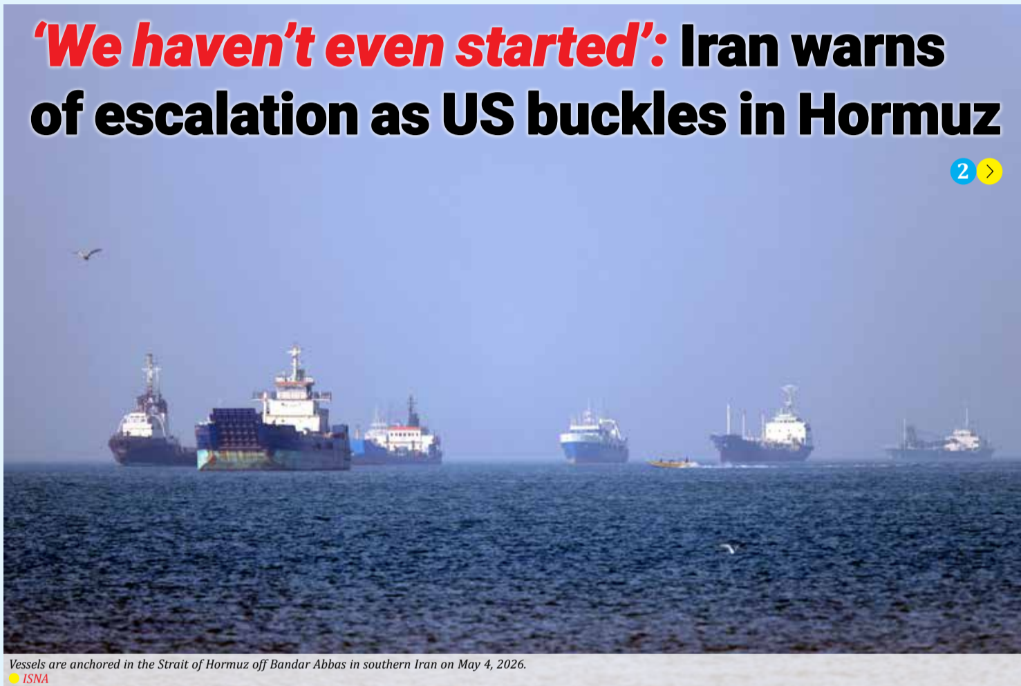
Vessels are anchored in the Strait of Hormuz off Bandar Abbas in southern Iran on May 4, 2026.