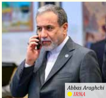
Abbas Araghchi

Since the failure of the first round of the negotiations in Pakistan, regional countries have been trying to get the US and Iran to the second round of ne-