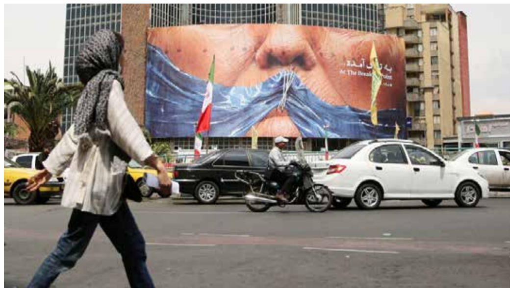
Vehicles drive past a billboard with graphic showing Strait of Hormuz and sewn lips of US President Donald Trump in the Valiasr Square in downtown Tehran, Iran, in May 2026.

decisive role in shaping the new regional order. The region can no longer be regarded as indifferent or passive. Once again, Iran signals through these new policies that it seeks a new order — one rooted in national strength and willpower, not merely diplomatic and political measures, but built upon unrivaled naval influence and real regional power projection in the Persian Gulf and the Makoran Sea.