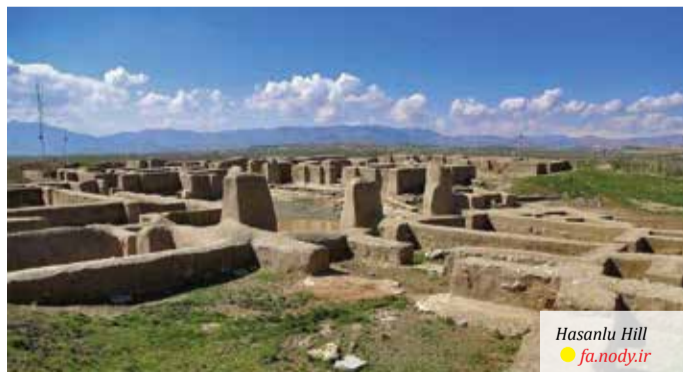
Hasanlu Hill fa.nody.ir

These sites together highlight the extraordinary cultural and historical depth of the region and its importance in world heritage.