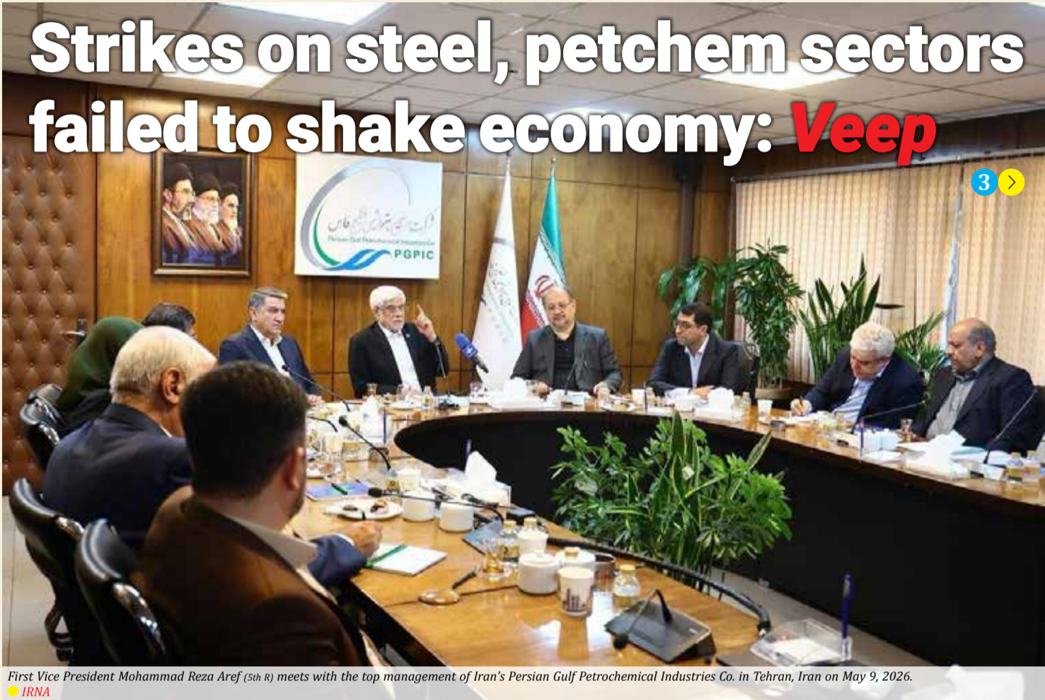
First Vice President Mohammad Reza Aref (5th R) meets with the top management of Iran's Persian Gulf Petrochemical Industries Co. in Tehran, Iran on May 9, 2026.