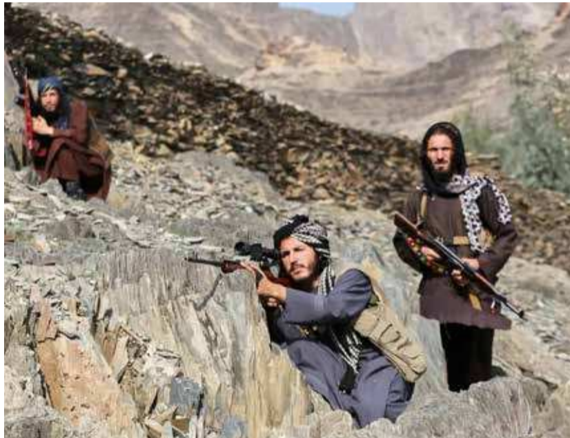
Taliban soldiers look toward Pakistan from the Afghan side of the Torkham border crossing in February 2026.