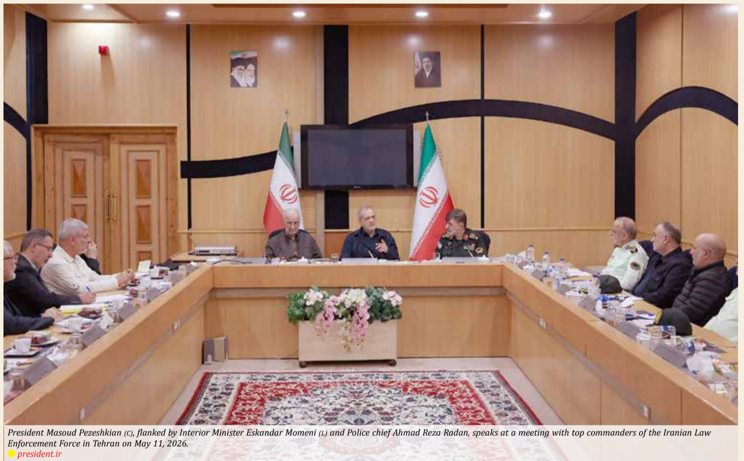
President Masoud Pezeshkian (c), flanked by Interior Minister Eskandar Momeni (l) and Police chief Ahmad Reza Radan, speaks at a meeting with top commanders of the Iranian Law Enforcement Force in Tehran on May 11, 2026.