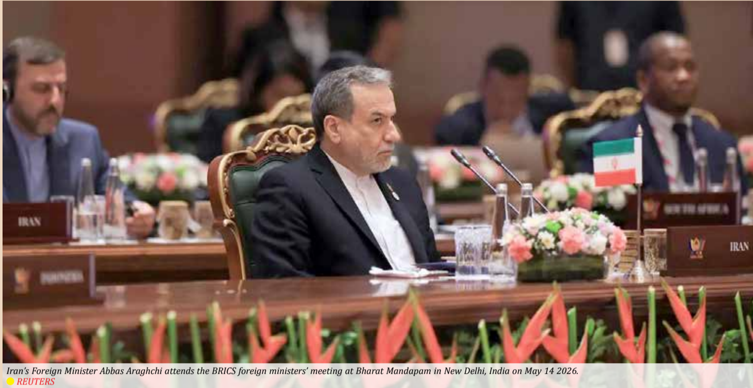
Iran's Foreign Minister Abbas Araghchi attends the BRICS foreign ministers' meeting at Bharat Mandapam in New Delhi, India on May 14 2026.