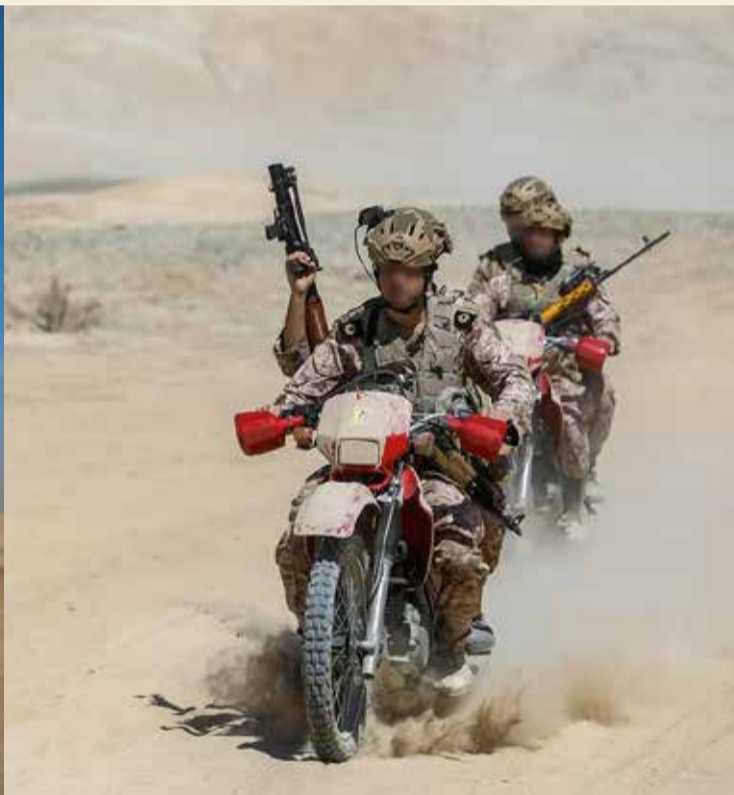
The combo shows members of Iran's Islamic Revolution Guards Corps at a military drill around the capital in Tehran on May 9, 2026.