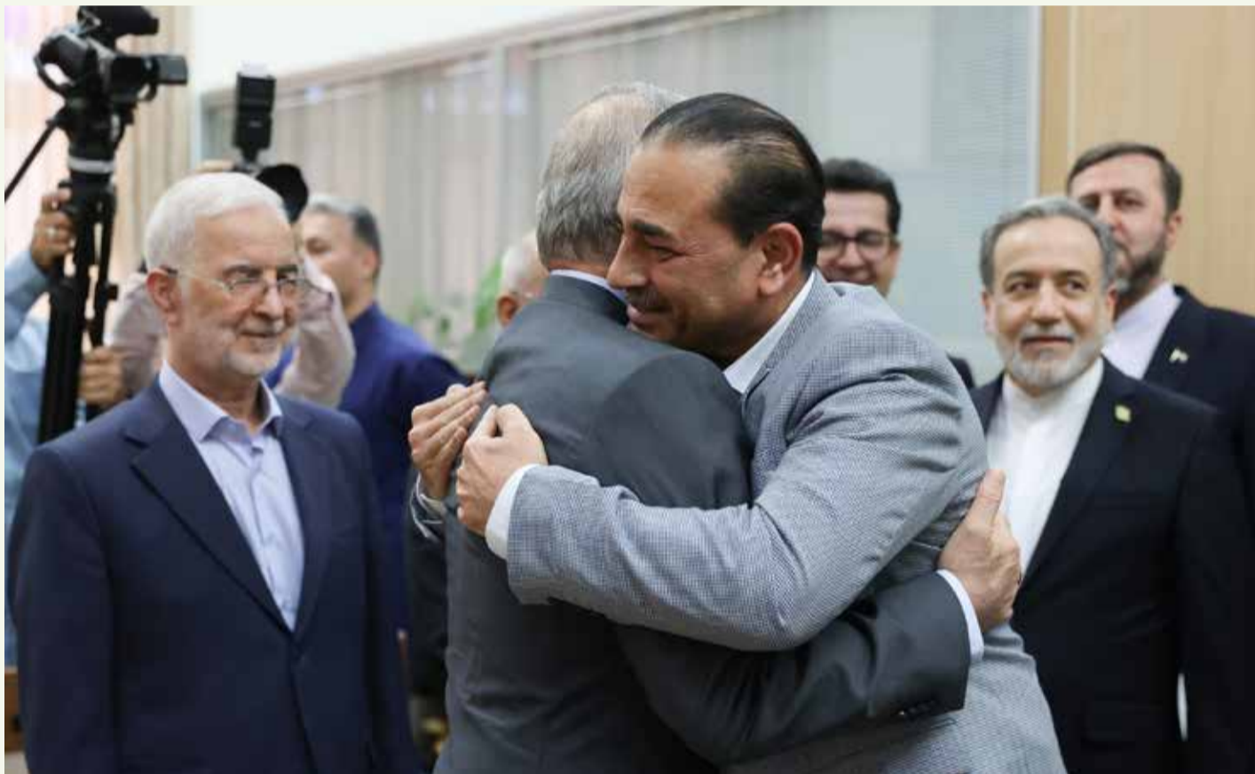
President Masoud Pezeshkian (Front Left) embraces Pakistan's Army Chief Asim Munir in Tehran on May 23, 2026.