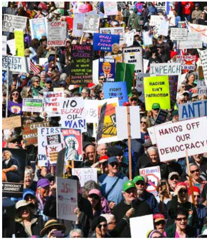
People protesting the US war of choice against Iran gather at Springfield City Hall, the US, on March 28, 2026, for the third "No Kings" rally.

It should be recalled that President Obama could not secure Congressional ratification of the JCPOA, but the more important point is that many of the Democrats themselves in Congress did not support Obama's JCPOA. Only a few individ-