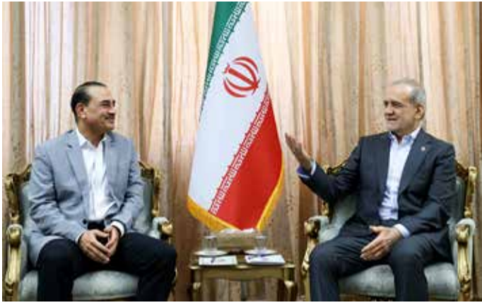
Iranian President Masoud Pezeshkian (R) talks with Pakistan's Army Chief Field Marshal Asim Munir in Tehran on May 23, 2026.