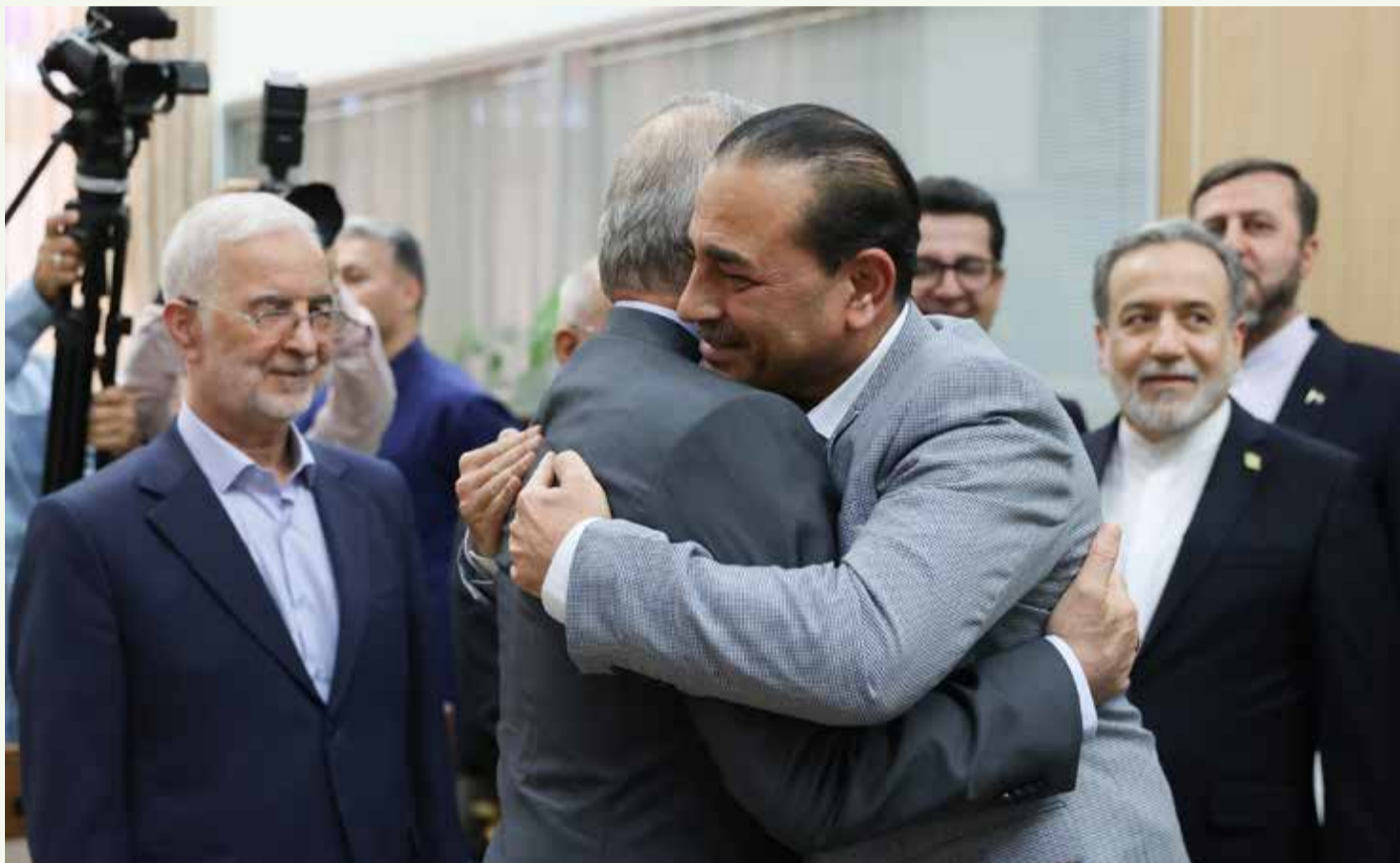
President Masoud Pezeshkian (Front Left) embraces Pakistan's Army Chief Asim Munir in Tehran on May 23, 2026.