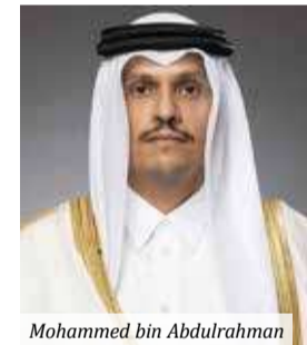
Mohammed bin Abdulrahman

Qatar's top diplomat stressed the need for all parties to engage constructively in order to secure sustainable peace and enduring stability in the region as mediation efforts by Pakistan are underway to narrow the gap between Tehran and Washington in