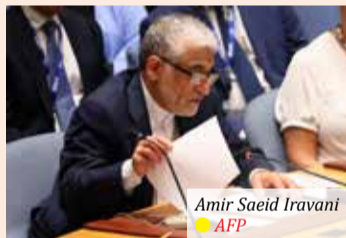
Amir Saeid Iravani

"Despite the Security Council's failure to hold the states along the southern shores of the Persian Gulf and Jordan accountable for their internationally unlawful acts against Iran, they are under an obligation as responsible states to make full reparation to the Islamic Republic of Iran, including compensation for all material and moral damage caused by their internationally wrongful acts," he said.