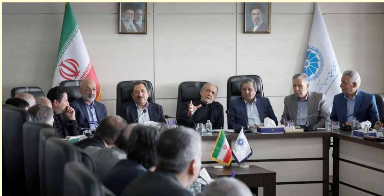
President Masoud Pezeshekian (c), flanked by CBI Governor Abdolnaser Hemmati (3rd R) and Industry Minister Mohammad Atabak, speaks at a meeting in Iran's Chamber of Commerce in Tehran on May 25, 2026.