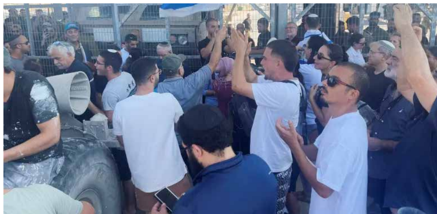
Right-wing protesters applaud the suspects of the abuse of a Palestinian detainee outside the Sde Teiman detention facility near Beersheba, occupied Palestine.

The article first appeared on Mondoweiss.