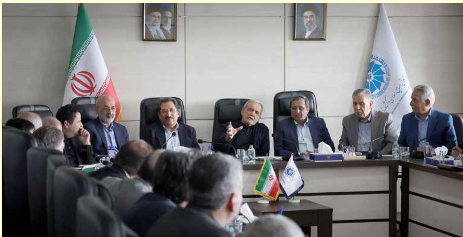
President Masoud Pezeshkian (C), flanked by CBI Governor Abdolnaser Hemmati (3rd R) and Industry Minister Mohammad Atabak, speaks at a meeting in Iran's Chamber of Commerce in Tehran on May 25, 2026.