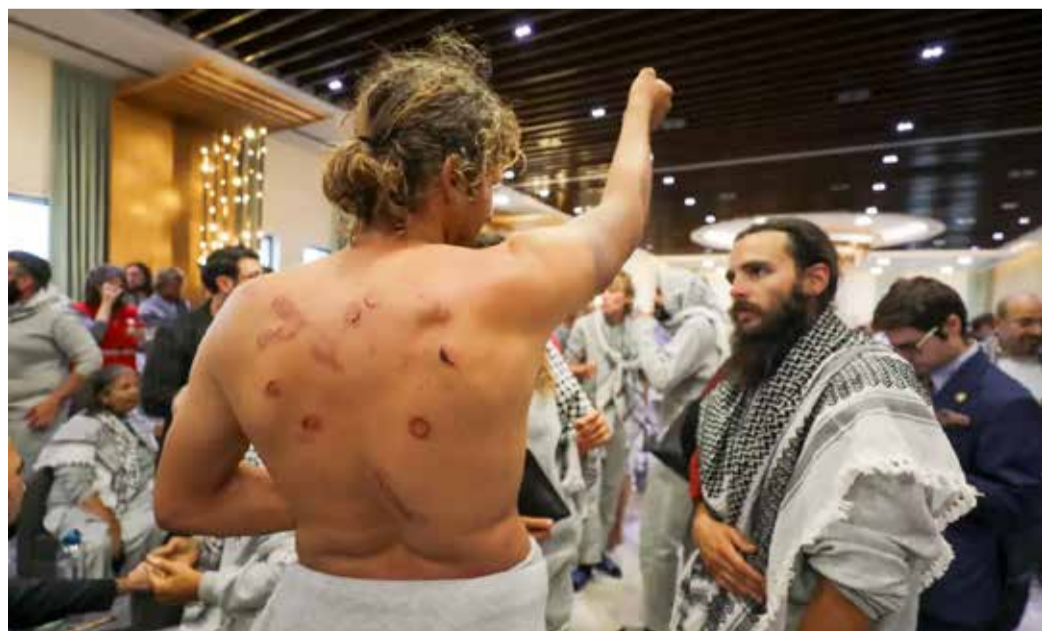
Traces of injuries inflicted by Israeli soldiers are visible on the body of one of the male members of the Global Sumud Flotilla upon their arrival at Istanbul International Airport, Turkey, on May 21, 2026. AFP confirmed on site.

Ben-Gvir's video of abused flotilla activists reveals a state so accustomed to impunity that it documents its own cruelty, even against Westerners. It is likely only a matter of time before the arrogance catches up. South Africa's genocide case against Israel is ongoing at The Hague, and much of its evidentiary record comes directly from Israeli officials, soldiers and journalists — through their own videos, speeches, interviews and social media posts.