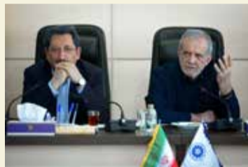
President Masoud Pezeshkian (R) speaks during a meeting with members of the Chamber of Commerce in Tehran, Iran, on May 25, 2026.

In response, the Iranian Armed Forces carried out 100 waves of counter-attacks over 40 days, targeting US and Israeli military assets, which