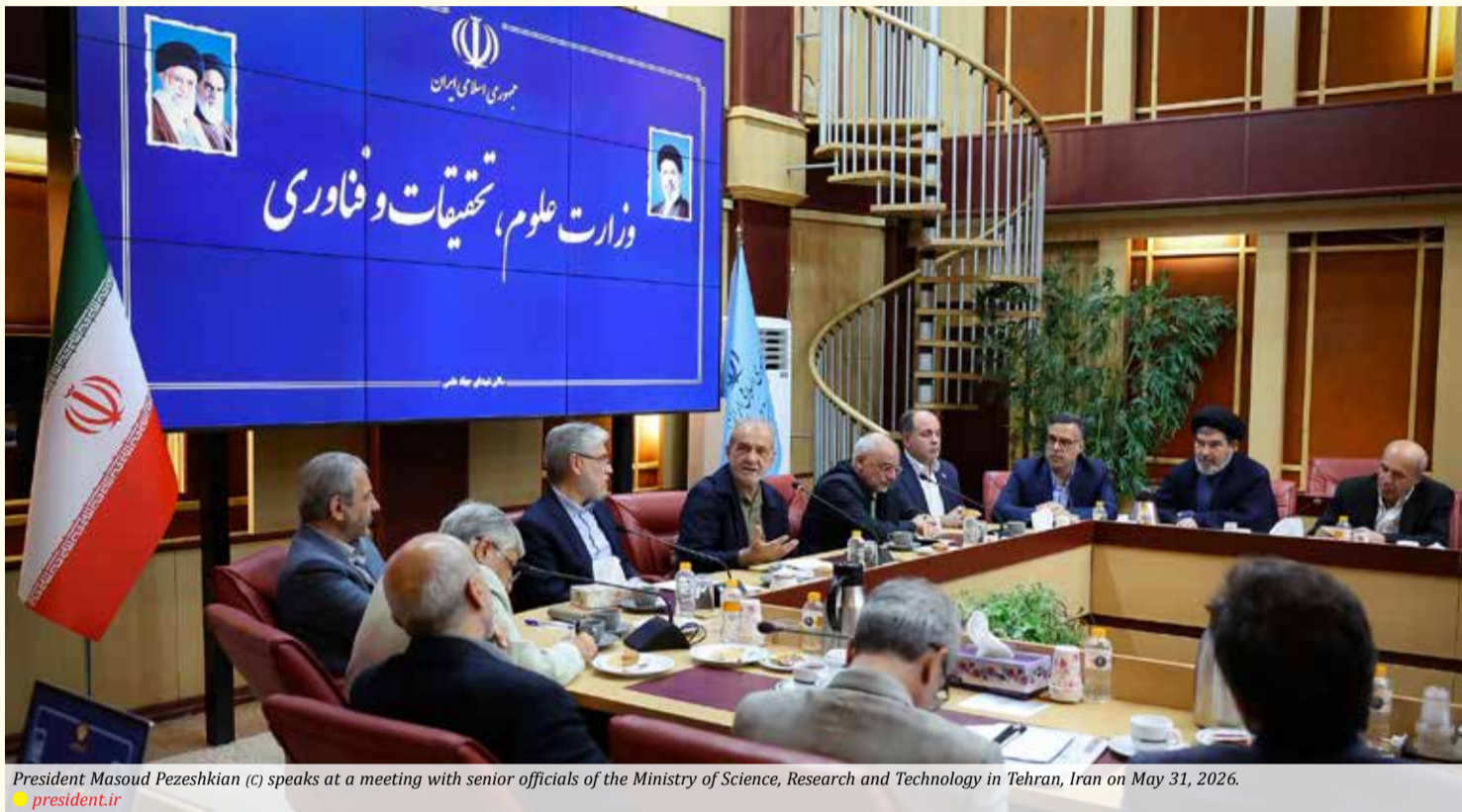
President Masoud Pezeshkian (c) speaks at a meeting with senior officials of the Ministry of Science, Research and Technology in Tehran, Iran on May 31, 2026.