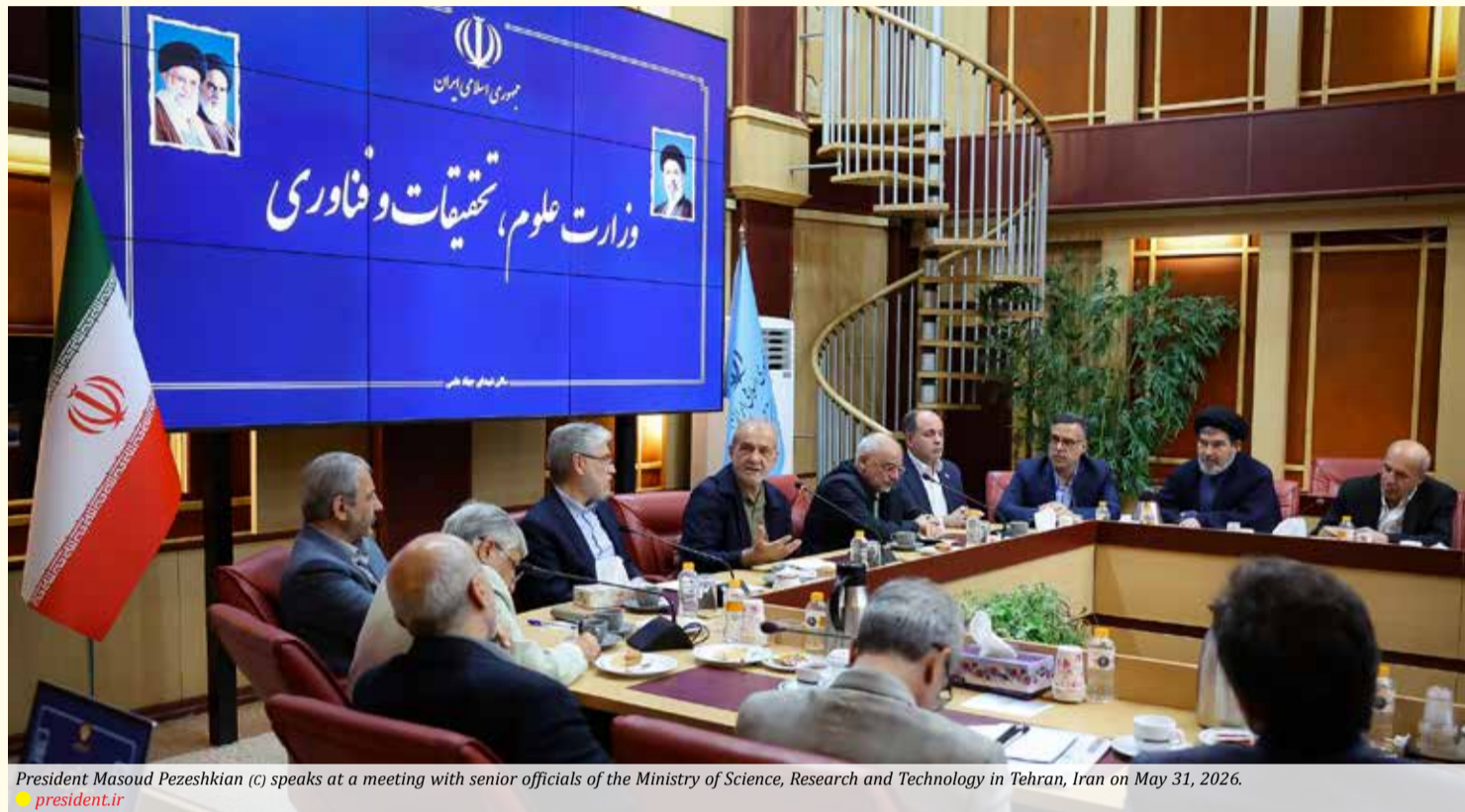
President Masoud Pezeshkian (c) speaks at a meeting with senior officials of the Ministry of Science, Research and Technology in Tehran, Iran on May 31, 2026.