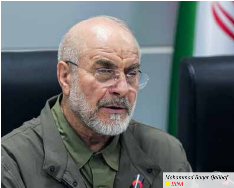
Mohammad Baqer Qalibaf