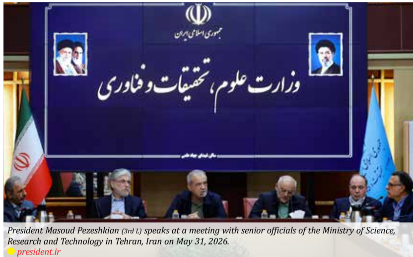
President Masoud Pezeshkian (3rd L) speaks at a meeting with senior officials of the Ministry of Science, Research and Technology in Tehran, Iran on May 31, 2026.