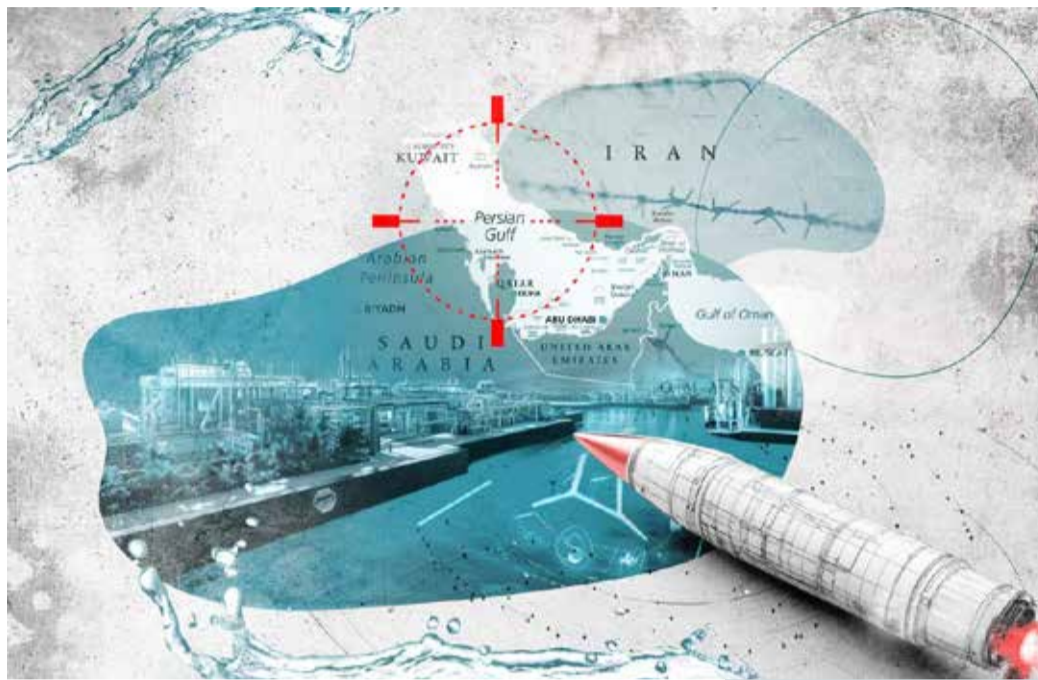
● ZEHRA KURULTUS/TÜRKIYE TODAY

2. Deepening strategic doubt among Arab states regarding US security guarantees: The 2026 war experience, and especially Washington's prioritization