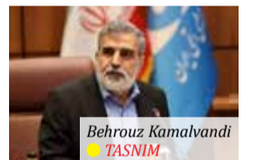
Behrouz Kamalvandi

"We started work on the Darkhovin power plant [in the southwestern Khuzestan province] to generate 350 megawatts so that it can supply industries. Today, a significant portion of Bushehr Units 2 and 3, which are under construction, has been built domestically. Serious measures have also