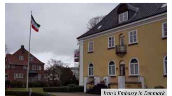
Iran's Embassy in Denmark

"The baseless accusations against Iran are part of a broader process of political and international isolation