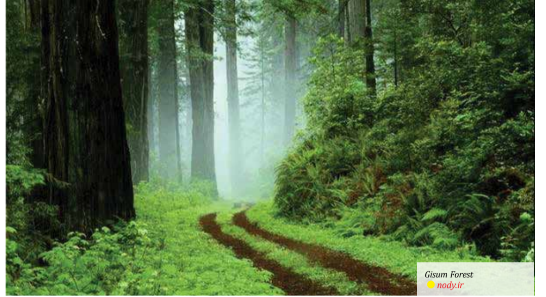
Gisum Forest nody.ir