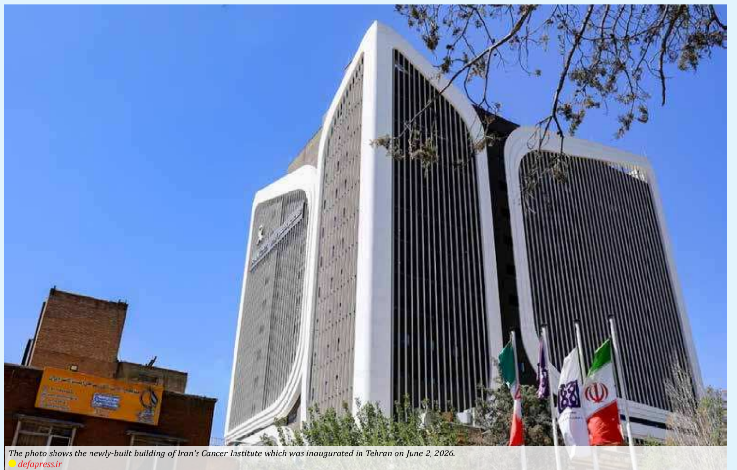
The photo shows the newly-built building of Iran's Cancer Institute which was inaugurated in Tehran on June 2, 2026.