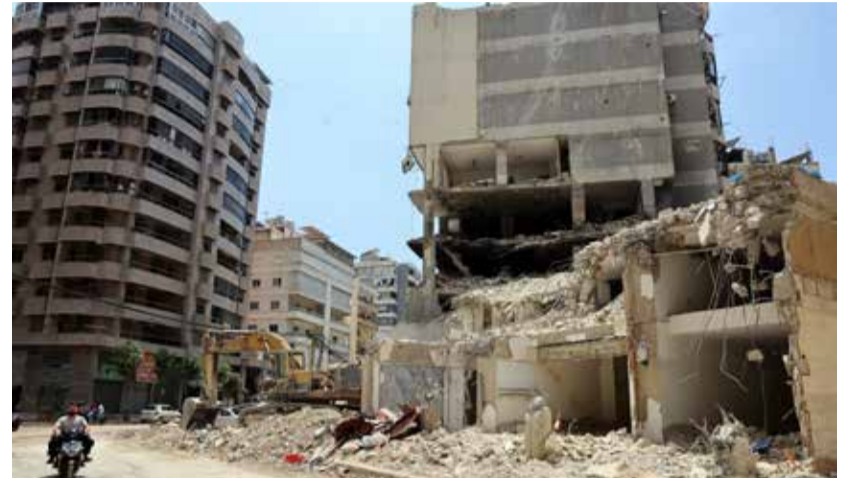
People ride a motorbike past a destroyed building in an Israeli airstrike at a neighborhood in Beirut's southern suburbs on June 2, 2026.

The Lebanese Embassy in Washington also announced that Hezbollah has agreed to an American proposal calling for a reciprocal halt in attacks with Israel, marking