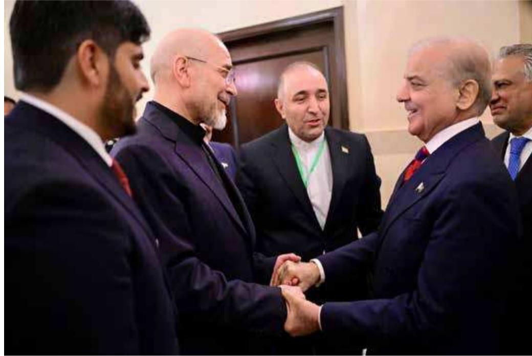
Pakistan's PM Shehbaz Sharif (center) greets Iran's parliamentary speaker and head of the negotiation team Mohammad Baqer Qalibaf on April 11, 2026, prior to the US-Iran talks in Islamabad, Pakistan.

Had the Trump administration opted to undertake strikes against Iran's energy and civilian infrastructure, as the president often threatened, the next phase of conflict could have been catastrophic for the Persian Gulf. Already, their energy production — the lifeblood of their economies — has been up-