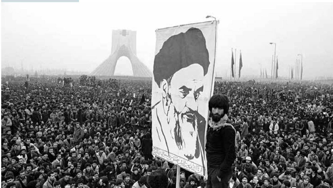
Demonstrators hold up a poster of exiled Muslim leader Ayatollah Ruhollah Khomeini during an anti-Shah demonstration in Tehran, Iran, on December 10, 1978.

The article was first published in Persian by the Institute for Compilation and Publication of Imam Khomeini's Works.