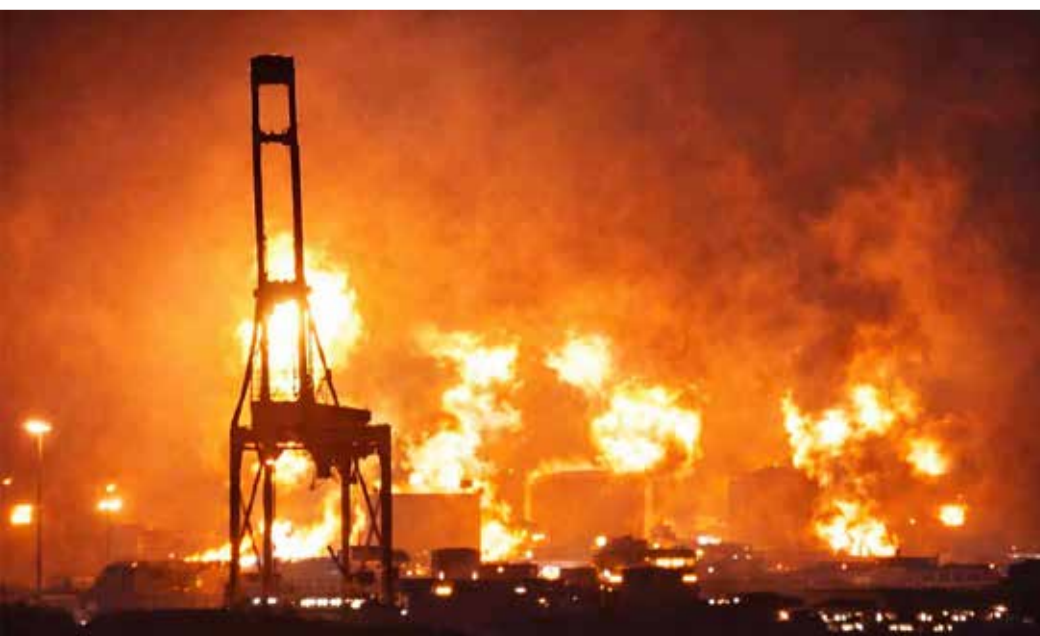
A retaliatory Iranian attack on Qatar's Ras Laffan Industrial City, which houses the world's largest liquefied natural gas (LNG) export facility, has erupted fire and disrupted activities on late March 2026.

have lobbied President Trump to avoid another round of conflict with Iran and instead pursue diplomacy.