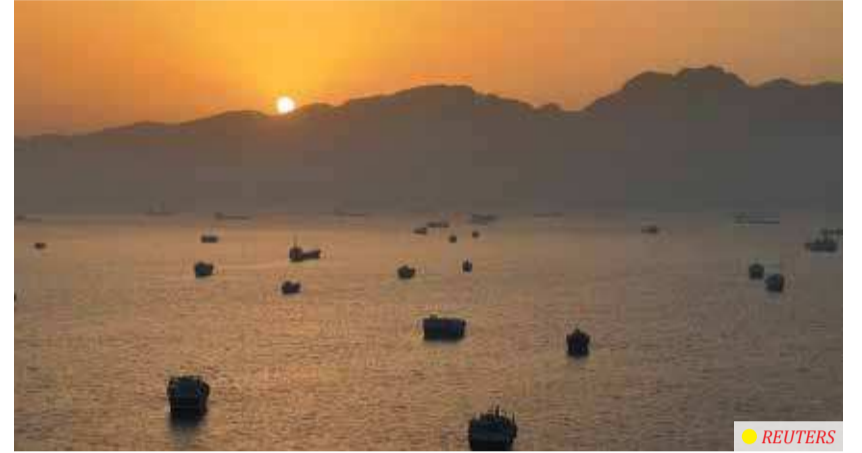
94%. A drone view shows vessels anchored at the Strait of Hormuz, as seen from Musandam, Oman, on May 30, 2026.

Shipping traffic has collapsed compared with pre-conflict levels. According to maritime intelligence firm Windward, the strait historically handled approximately 120 transits per day in both directions before the war. As of late May, that figure has fallen to roughly seven transits per day – a decline of about