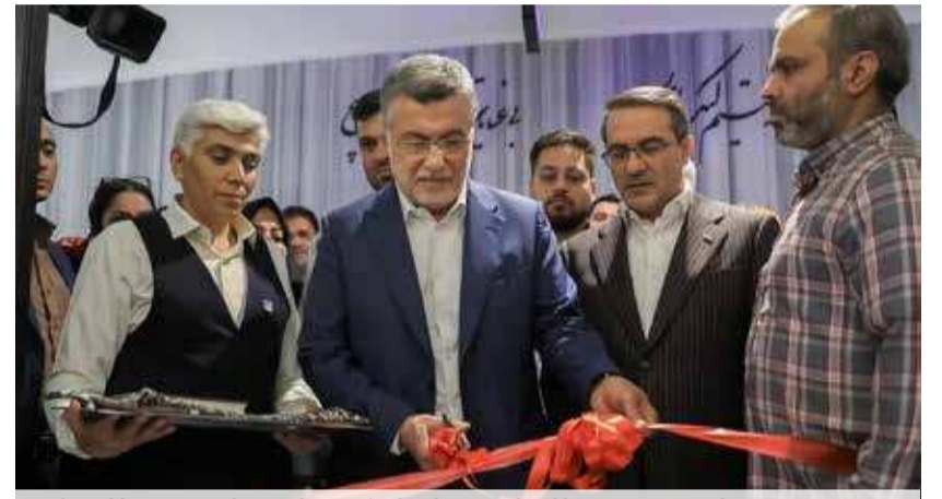
Iran's Health Minister Mohammadreza Zafarghandi (c) cuts the ribbon to inaugurate the new Iran Cancer Institute in Tehran, Iran, June 2, 2026.