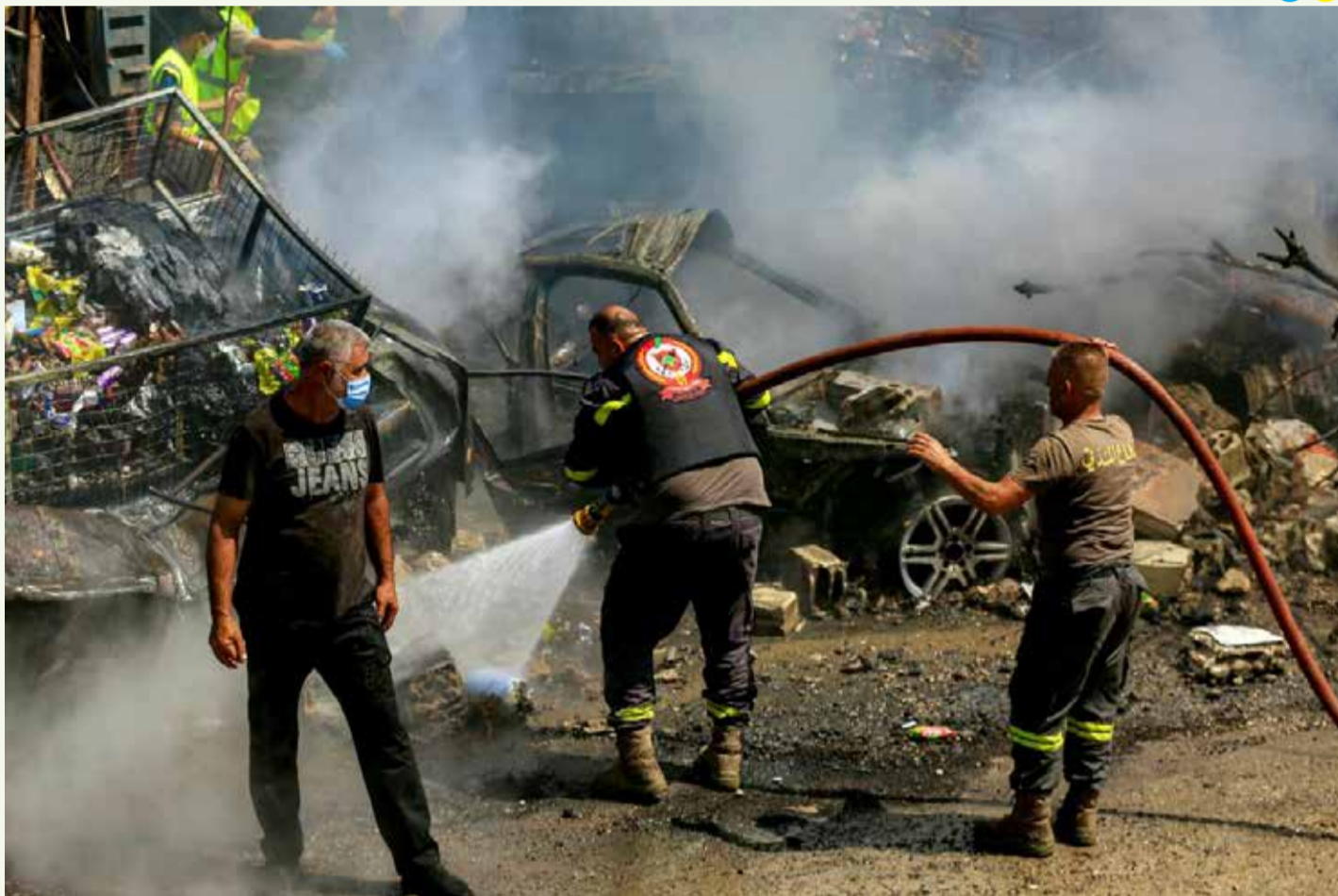
Civil defense members extinguish a fire following Israeli bombardment on a building in the village of Saksakiyeh in southern Lebanon on June 6, 2026.