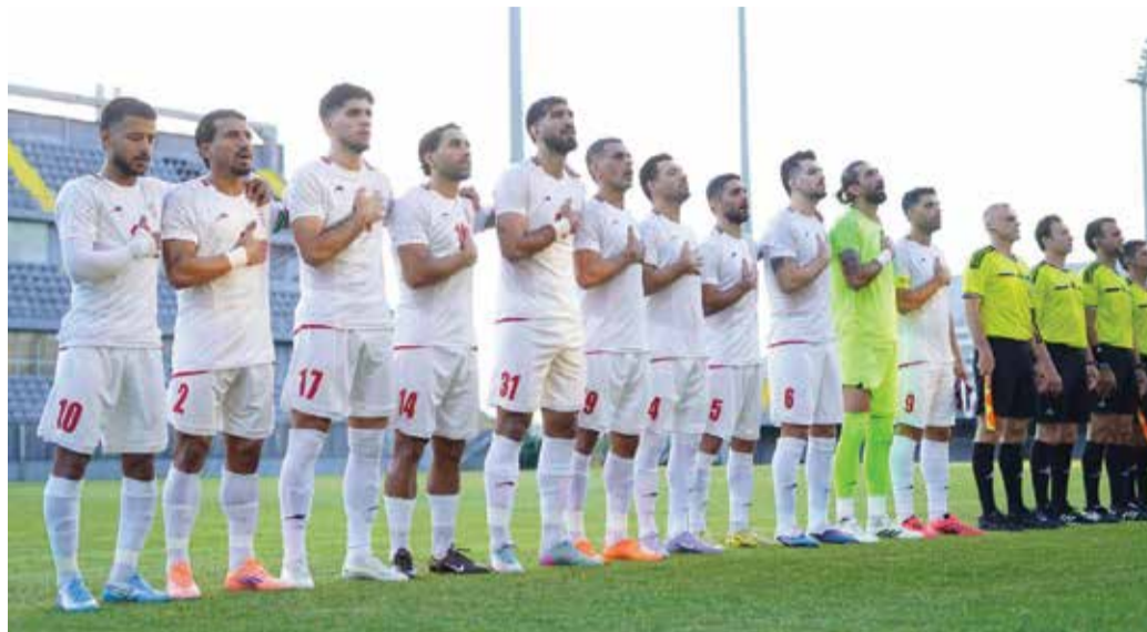
Iranian players are pictured ahead of a friendly against Mali in Antalya, Türkiye, on June 4, 2026.

"Why do you not say that visas were denied to a large portion of the managerial and executive