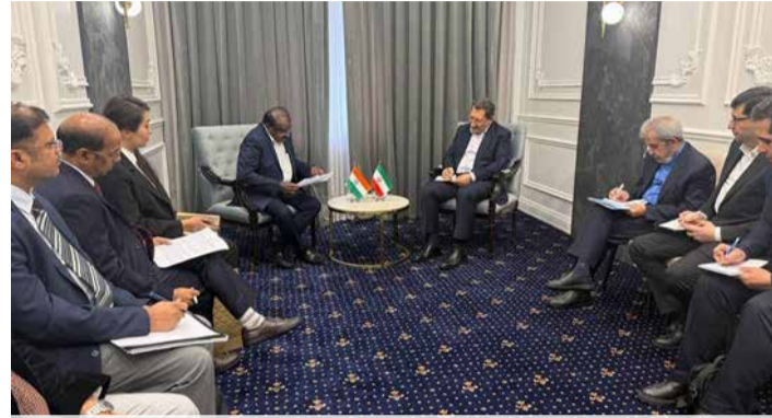
Iran's Minister of Industry, Mine and Trade, Mohammad Atabek (4th R) meets India's Minister of Heavy Industries H.D. Kumaraswamy (4th L) in Bishkek, Kyrgyzstan on June 6, 2026.

Atabak, who is leading an official delegation at the SCO industry ministers' meeting in Bishkek, said on Friday that all industry ministers from the organization's member states were participating