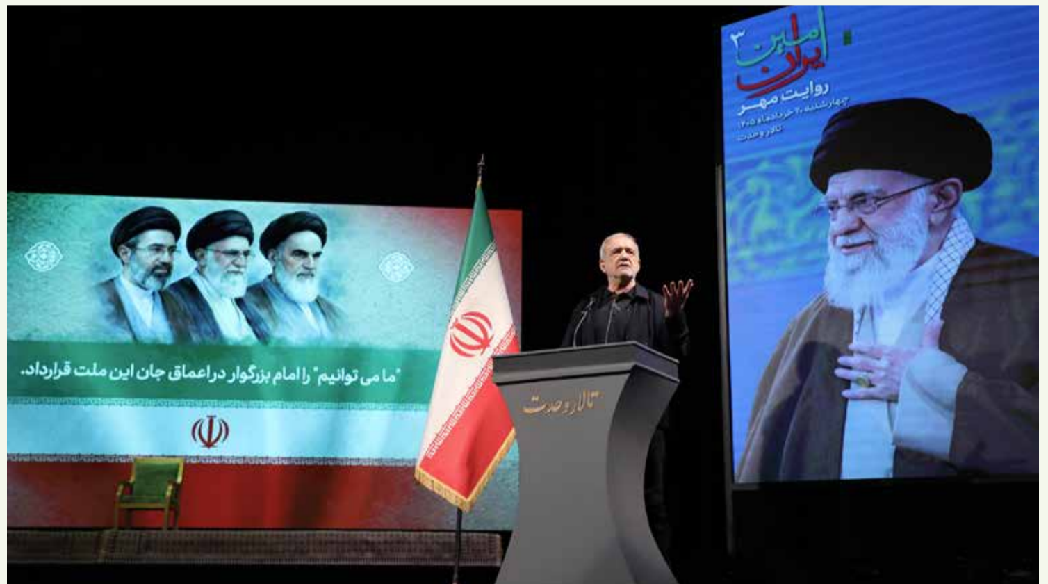
Iran's President Masoud Pezeshkian delivers a speech at a memorial for martyred Leader of the Islamic Revolution Ayatollah Sayyed Ali Khamenei in Tehran on June 10, 2026.