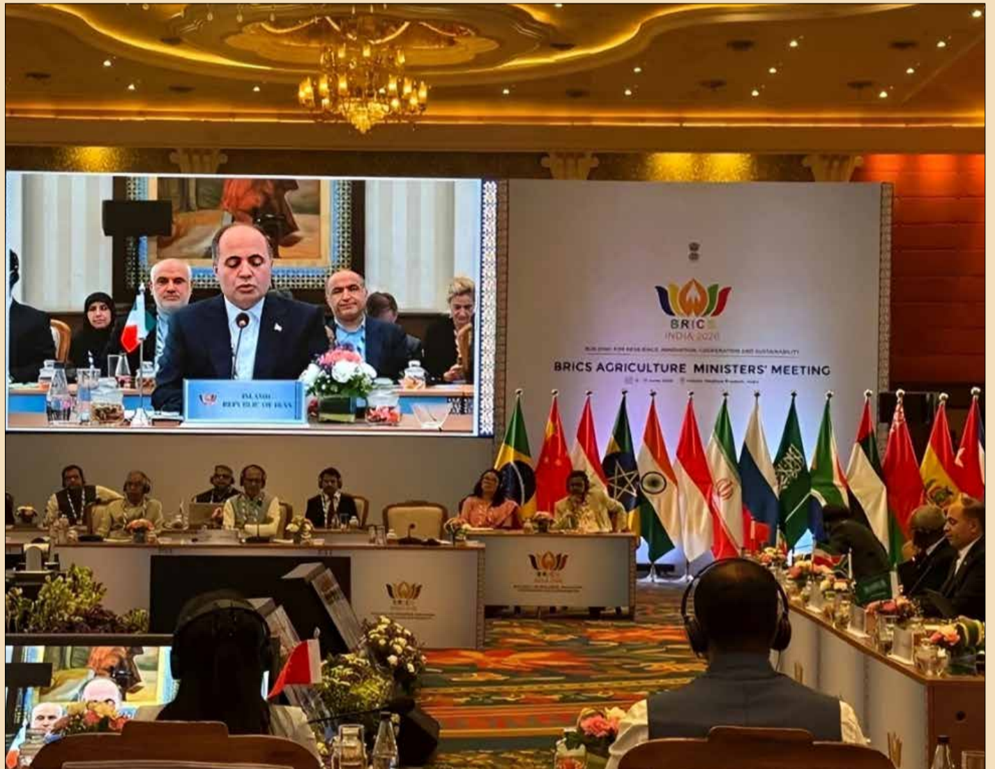
Iranian Agriculture Minister Gholamreza Nouri Qezeljeh (shown on the screen) delivers a speech at a BRICS agriculture ministers' meeting in Indore, India on June 12, 2026.