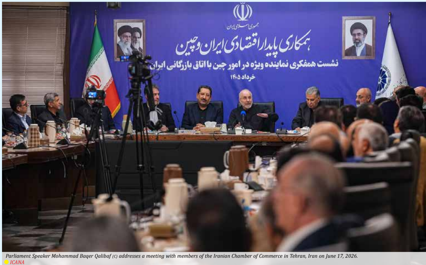
Parliament Speaker Mohammad Baqer Qalibaf (c) addresses a meeting with members of the Iranian Chamber of Commerce in Tehran, Iran on June 17, 2026.