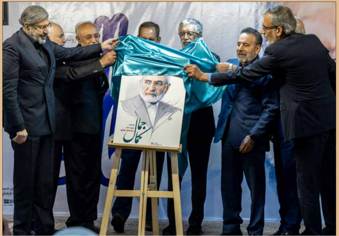
A group of former and incumbent Iranian officials unveils a book about former foreign minister Kamal Kharrazi, who was assassinated in an airstrike on his home in Tehran in April during the US-Israeli war on Iran, during a ceremony in the Iran Cultural and Press Institute in Tehran on June 28, 2026.