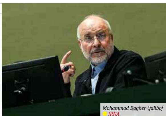
Mohammad Baqer Qalibaf

"Imagine having forty-something million of